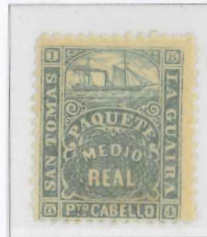
With watermark fragment