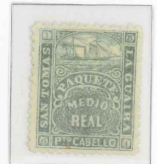
Position 79 CABELLO's "O" is joined to the outer frame by a grey line