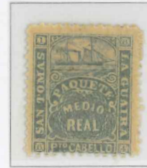
Position 80 Grey stain on CABELLO's "LL"