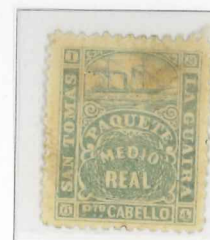
Position 92 Two gray stains below LA's "L"

Complete 100 stamps sheet; Note upper left corner folded.