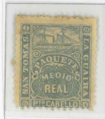
Position 39 Gray stains on TOMAS's "T" and "O"