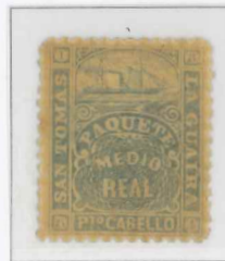
Position 35 8's box broken