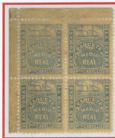
Only stamps known with perforation change and drawing displacement in the second line; engraving's size correction (2 stamp's sizes)