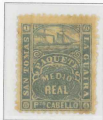
Position 3 Cut in frame TOMAS's "A"