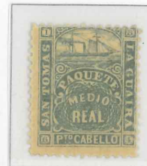
Position 43 White stain over PAQUETE's "Q"