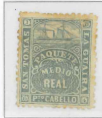
Position 66 8's box broken