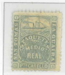
Position 92 Two gray stains below LA's "L"