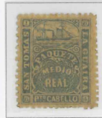
Position 42 An eight (8) instead of a B