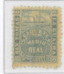
Position 96 White spot on Medios's "O"