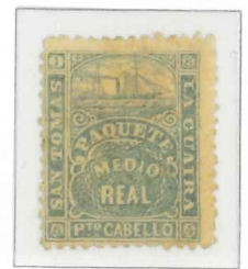
Position 92 Two gray stains below LA's "L"