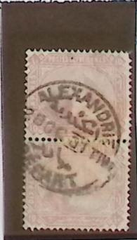
Used pair cancelled Alexandria October 28 th 1881