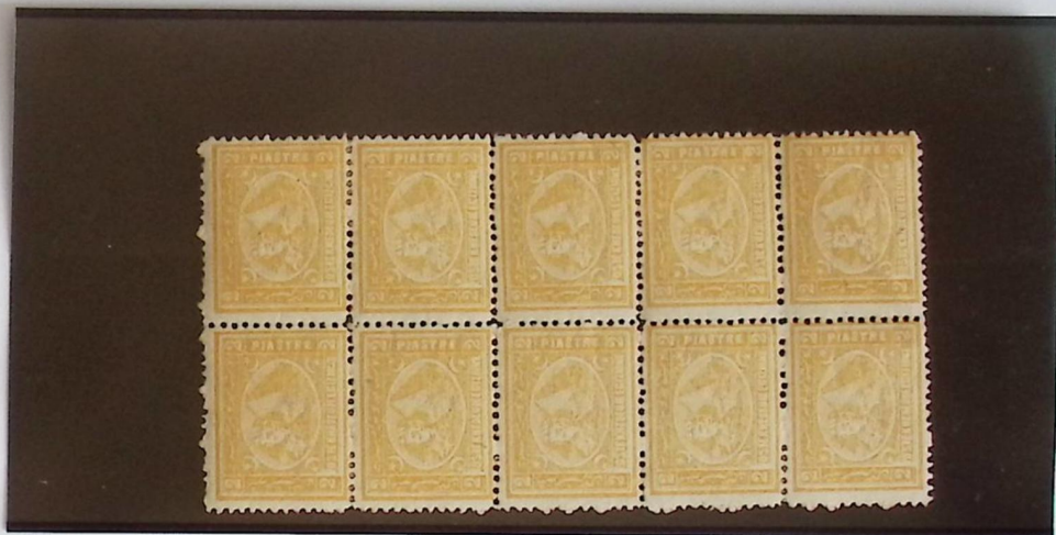
Block of ten Inverted watermark Perf 13 and a quarter by 12 and a half Fresh colour and gum