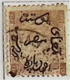
Perforated 12½, watermark upright, Type I. Black cancellation.