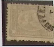
10 para grey lilac perf 13.5 x 12.5