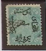
20 pa pale blue Perf 12.5 Watermark upright Cancelled by RETTA in black