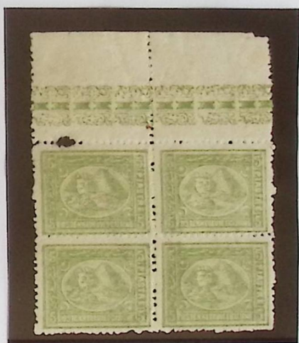
Perf 12.5 Fine mint upper marginal block of four with ornamental margin Small fault affecting the upper left stamp