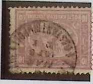
10 para mauve Perf 13.5