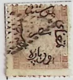
Perforated 12½, watermark upright, Type I. Black 'Retta', cancellation.