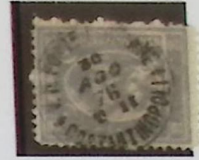
20 para grey-blue perf 13.5 x 12.5