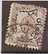
1 pi Claret 12.5 x 13 x 13 x 12.5 Cancelled by black CDs