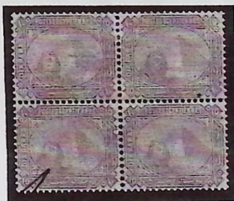
January 1881. 10pa claret. 720,000 stamps printed, most of which were used.