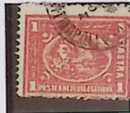
1 pi. Rose red Different shades Perf 12.5 x 13