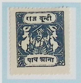
Like SG 73 ¼ anna ultramarine Medium white wove paper Perf. 11, Type H inscription Cliché forgery like A Maybe photo. rather than typo. printing.