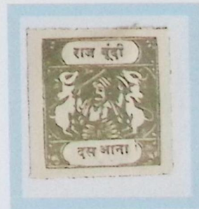
Like SG 43a 10 annas drab vs. actual s/b olive-sepia White medium wove paper Type C inscription F1 forgery cliché B