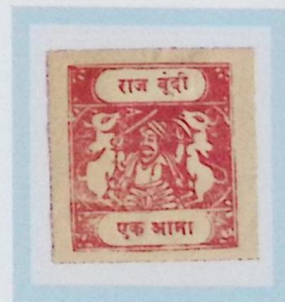
Like SG 39a 1 anna carmine Toned medium wove paper Type C inscription F1 forgery cliché C