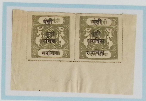
Like SG O21A 10 annas olive-green s/b brown-olive Bottom marginal pair White medium wove paper Type C inscription, ovpt. O1 F1 forgery clichés C & D