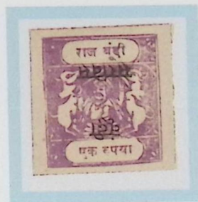
Like SG O23A 1 rupee lilac White medium wove paper Type C inscription, ovpt. O1 F1 forgery cliché B