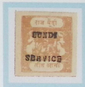
Like SG O3B 3 annas cinnamon s/b chestnut Toned medium wove paper Type A inscription, ovpt. O2 F1 forgery cliché B