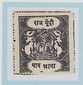
Like SG 37a ¼ anna indigo Medium off-white wove paper Type C inscription Cliché forgery like A? Maybe photo. rather than typo. printing.