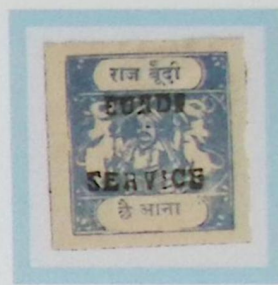
Like SG O4B 6 annas new blue s/b cobalt White medium wove paper Type A inscription, ovpt. O2