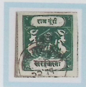
Like SG O22A 12 annas myrtle-green s/b sage-green White pelure paper Type C inscription, ovpt. O1 F2 forgery cliché C 22 April 1919 on small card