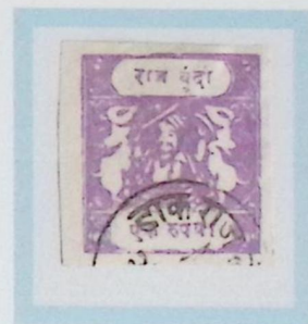
Like SG 45 1 rupee lilac White pelure paper Type C inscription F2 forgery cliché C 22 April 1919