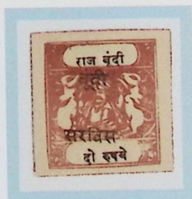
Like SG O24A 2 rupees red-brown and black Toned medium wove paper Type C inscription, ovpt. O1 F1 forgery cliché C