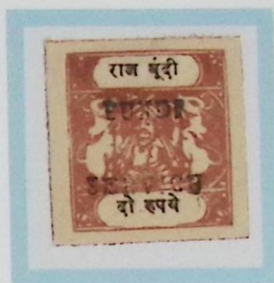
Like SG O24B 2 rupees red-brown and black Toned medium wove paper Type C inscription, ovpt. O2 F1 forgery cliché B