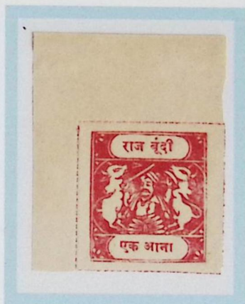
Like SG 39a 1 anna carmine White medium wove paper Type C inscription F1 forgery cliché A