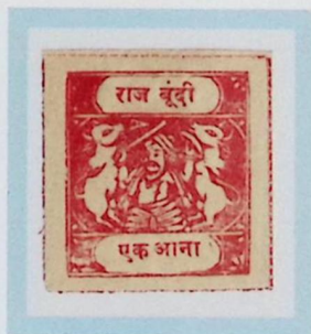
Like SG 39a 1 anna carmine White medium wove paper Type C inscription F1 forgery cliché B