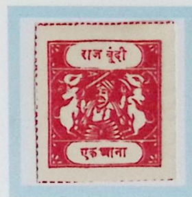
Like SG 63 var. 1 anna scarlet-vermilion Thin white wove paper (Not Laid) Type E inscription Cliché forgery like C Maybe photo. rather than typo. printing.