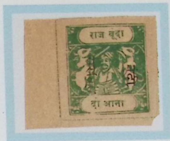
Like SG O18A 2 annas green s/b emerald Toned medium wove paper Type C inscription, ovpt. O1 F1 forgery cliché C