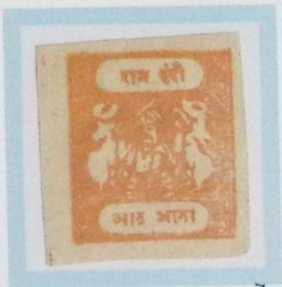
Like SG 34 8 annas pale orange s/b orange CRUDE IMPERF. forgery Medium toned wove paper Type B inscription