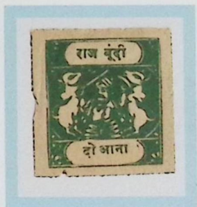
Like SG 40 2 annas myrtle green vs. actual s/b emerald Toned medium wove paper Type C inscription F1 forgery cliché B