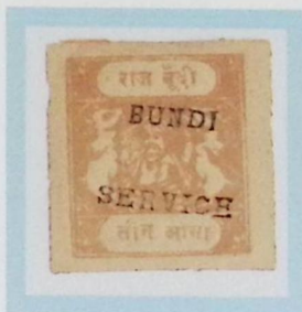
Like SG O3B 3 annas cinnamon s/b chestnut Toned medium wove paper Type A inscription, ovpt. O2 F1 forgery cliché A