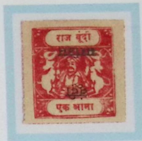
Like SG O17aA 1 anna carmine Toned medium wove paper Type C inscription, ovpt. O1