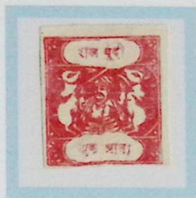
Like SG 61 1 anna carmine-red Medium white wove paper (not thick) Type E inscription Cliché forgery like A? Maybe photo. rather than typo. printing.