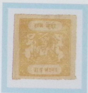
Like SG 21 2½ annas chrome-yellow Toned medium wove paper Type A inscription F1 forgery cliché D