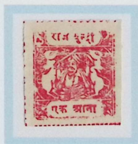
Like SG 65 1 anna carmine s/b scarlet Medium white wove paper Type G inscription Cliché forgery like C Maybe photo. rather than typo. printing.