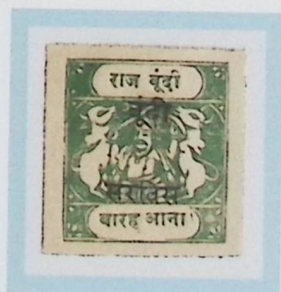
Like SG O22A 12 annas yellowish-green s/b sage-green White medium wove paper Type C inscription, ovpt. O1 F1 forgery cliché B