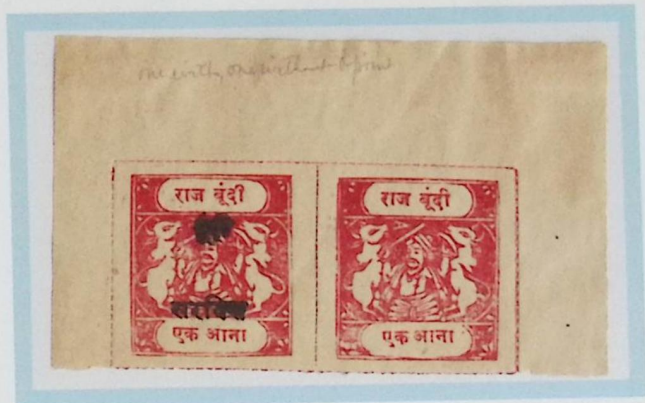
Like SG O17aA var. 1 anna carmine Top marginal pair one stamp without overprint Toned medium wove paper Type C inscription, ovpt. O1 F1 forgery clichés A & B