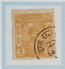
Like SG 90 4 annas yellow s/b orange White medium wove paper Perf. 11 Probably a photograph reproduction forgery. Day of postmark "12" but the month and year are not visible.