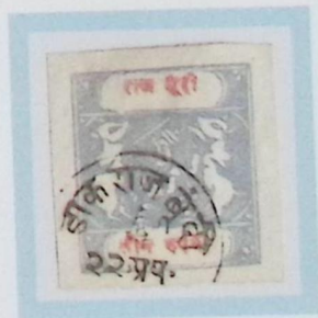
Like SG 47 3 rupees blue and red- brown White pelure paper Type C inscription F2 forgery cliché A 22 April 1919