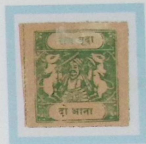
Like SG O18A var. 2 annas light green s/b emerald Toned medium wove paper Type C inscription, ovpt. O1 on BACK F1 forgery cliché C