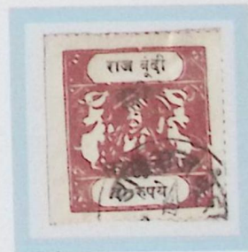
Like SG O24A 2 rupees red-brown and black White pelure paper Type C inscription, ovpt. O1 F2 forgery cliché C 22 April 1919