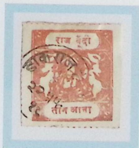
Like SG 22 3 annas chestnut White pelure paper Type A inscription F2 forgery cliché B 22 April 1919