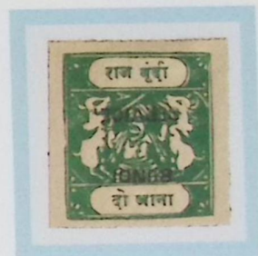
Like SG O18B 2 annas deep green s/b emerald Toned medium wove paper Type C inscription, ovpt. O2 F1 forgery cliché D