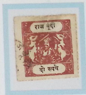
Like SG 46 2 rupees red-brown and black Toned white pelure paper Type C inscription F2 forgery cliché C 22 April 1919