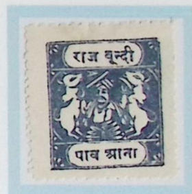
Like SG 73 ¼ anna ultramarine Medium white wove paper Perf. 11, Type H inscription Cliché forgery like C Maybe photo. rather than typo. printing.