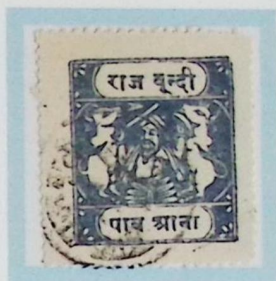
Like SG 73 ¼ anna ultramarine Medium white wove paper Perf. 11, Type H inscription Cliché forgery like C Maybe photo. rather than typo. printing. Date unreadable