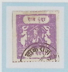
Like SG 45 1 rupee lilac White pelure paper Type C inscription F2 forgery cliché B 22 April 1919