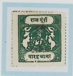
Like SG O22A 12 annas myrtle-green s/b sage-green White pelure paper Type C inscription, ovpt. O1 F2 forgery cliché A