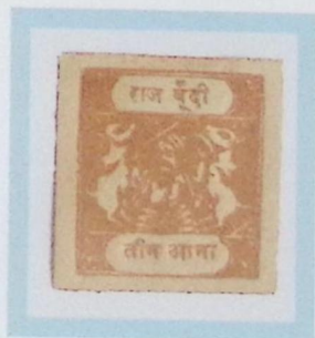
Like SG 22 3 annas chestnut Toned medium wove paper Type A inscription F1 forgery cliché B