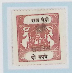
Like SG O24A 2 rupees red-brown and black White pelure paper Type C inscription, ovpt. O1 F2 forgery cliché C