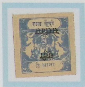
Like SG O4A 6 annas new blue s/b cobalt Toned medium wove paper Type A inscription, ovpt. O1 F1 forgery cliché C