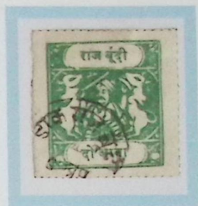
Like SG 40 2 annas emerald White pelure paper Type C inscription F2 forgery cliché C 7 April 1919