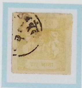
Like SG 21 2½ annas chrome-yellow Toned medium wove paper Type A inscription F1 forgery cliché C 22 April 1919

Forgery types F1 and F2 as detailed by R.J. Benns, pp 44 to 47. Both forgery types are \frac{3}{4} mm shorter than the genuine stamp and the forgeries show none of the characteristics of the genuine stamps. Each forged stamp is organized as the likely Gibbons catalog listing of the stamp.