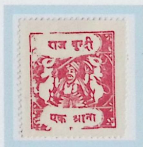
Like SG 75 1 anna scarlet-vermilion Medium white wove paper Perf. 11, Type G inscription Cliché forgery like A Maybe photo. rather than typo. printing.