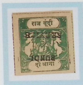
Like SG O18B 2 annas deep green s/b emerald Toned medium wove paper Type C inscription, ovpt. O2 F1 forgery cliché B