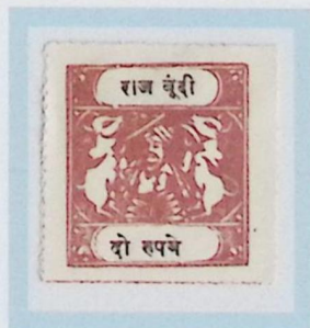
Like SG 46 2 rupees red-brown and black White pelure paper Type C inscription F2 forgery cliché C