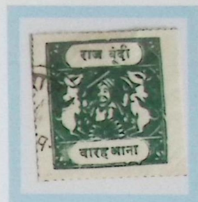
Like SG 44 var 12 annas myrtle-green vs. actual s/b sage-green White pelure paper Type C inscription F2 forgery cliché B 22 April 1919