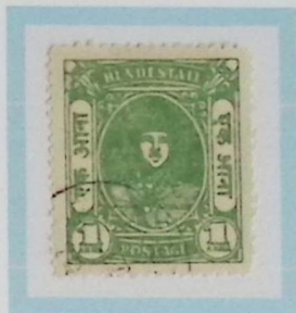
Like SG 88 1 anna yellow-green White medium wove paper Perf. 11 Probably a photograph reproduction forgery. Day of postmark "12" but the month and year are not visible.