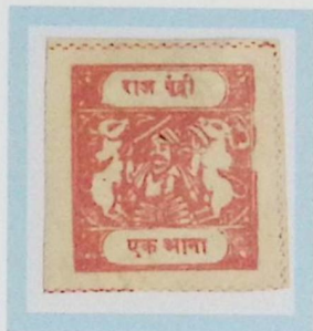
Like SG 28b 1 anna red Toned white pelure paper Type B inscription F2 forgery cliché D