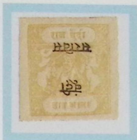
Like SG O2A 2½ annas stone s/b chrome-yellow Toned medium wove paper Type A inscription, ovpt. O1 F1 forgery cliché D