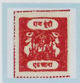
Like SG 63 1 anna scarlet-vermilion Appears like: thin white horizontal laid paper Type E inscription Cliché forgery like C Maybe photo. rather than typo. printing.