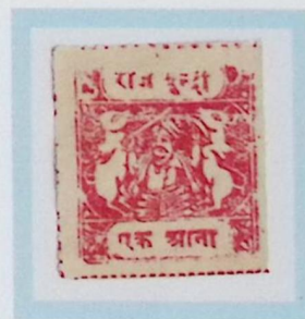
Like SG 65 1 anna carmine s/b scarlet Medium white wove paper Type G inscription Cliché forgery like C Maybe photo. rather than typo. printing.