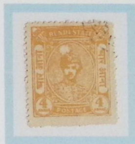
Like SG 90 4 annas yellow s/b orange White medium wove paper Perf. 11 Probably a photograph reproduction forgery. No postmark date visible.