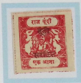
Like SG O17aA 1 anna carmine White medium wove paper Type C inscription, ovpt. O1 F1 forgery cliché A