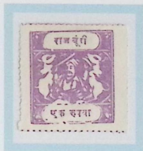
Like SG 45 1 rupee lilac White pelure paper Type C inscription F2 forgery cliché A