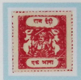
Like SG 28a 1 anna carmine Thin white wove paper Type B inscription Cliché forgery like C Maybe photo. rather than typo. printing.