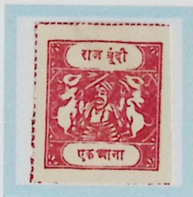
Like SG 28a 1 anna carmine Thin white wove paper Wide top and bottom margins Type B inscription Cliché forgery like C Maybe photo. rather than typo. printing.