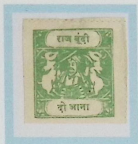
Like SG 40 2 annas yellow-green vs. actual s/b emerald White pelure paper Type C inscription F2 forgery cliché C