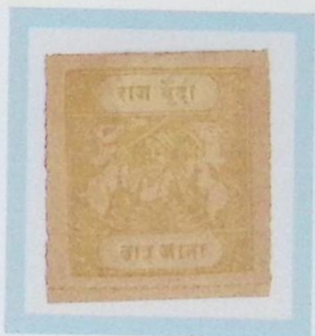
Like SG 21 2½ annas chrome-yellow Toned medium wove paper Type A inscription F1 forgery cliché D