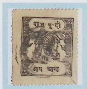
Like SG 74 ½ anna black Medium toned wove paper Perf. 11, Type H inscription Cliché forgery like A? Maybe photo. rather than typo. printing. 13 ??? 194?