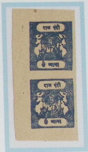
Like SG 33 6 annas blue s/b ultramarine Medium toned wove paper CRUDE IMPERF. forgery Type B inscription