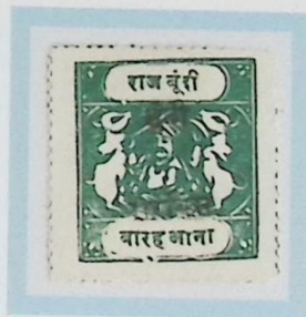
Like SG O22A 12 annas myrtle-green s/b sage-green White pelure paper Type C inscription, ovpt. O1 F2 forgery cliché C