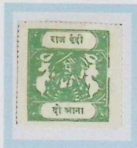
Like SG 29 2 annas emerald White pelure paper Type B inscription F2 forgery cliché D