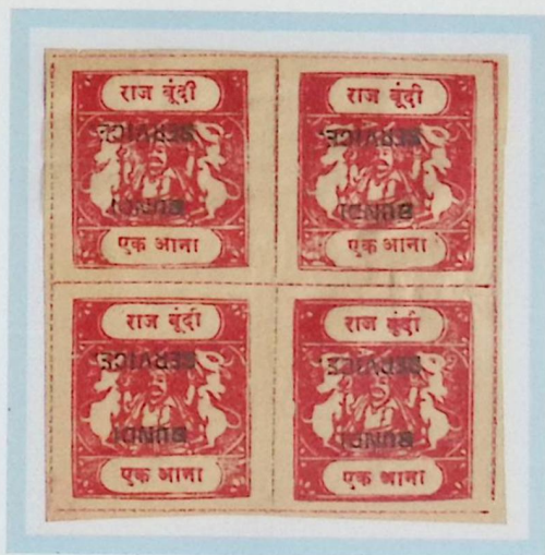
Like SG O17aB var. 1 anna carmine Official ovpt. O2 FORGEED Sheet of four with margins outside roulettes cut off Toned medium wove paper Type C inscription, ovpt. O2 F1 forgery clichés A, B, C & D