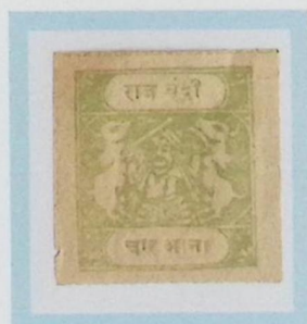
Like SG 41 4 annas apple-green vs. ac- tual s/byellow-green (dam) Toned medium wove paper Type C inscription F1 forgery cliché A