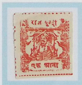
Like SG 65 1 anna scarlet Medium white wove paper Type G inscription Cliché forgery like C Maybe photo. rather than typo. printing.