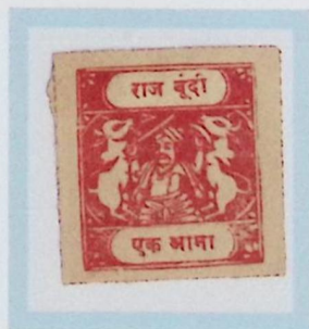
Like SG 39a 1 anna carmine Toned medium wove paper Type C inscription F1 forgery cliché C