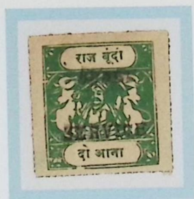
Like SG O18B 2 annas deep green s/b emerald White medium wove paper Type C inscription, ovpt. O2 F1 forgery cliché C