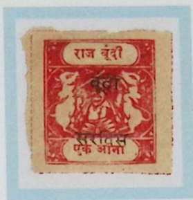
Like SG O17aA 1 anna carmine White medium wove paper Type C inscription, ovpt. O1 F1 forgery cliché A