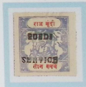
Like SG O25B 3 rupees blue and red- brown White medium wove paper Type C inscription, ovpt. O2 F1 forgery cliché A