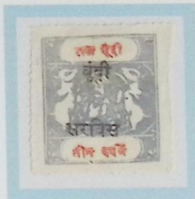
Like SG O25A 3 rupees blue and red- brown White pelure paper Type C inscription, ovpt. O1 F2 forgery cliché A