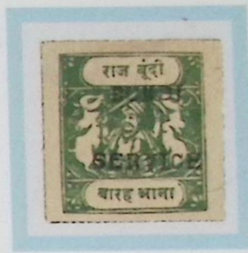
Like SG O22B 12 annas myrtle-green s/b sage-green Toned medium wove paper Type C inscription, ovpt. O2 F1 forgery cliché C