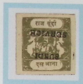
Like SG O21B 10 annas olive-green s/b brown-olive White medium wove paper Type C inscription, ovpt. O2 F1 forgery cliché B