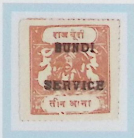
Like SG O3B 3 annas chestnut White pelure paper Type A inscription, ovpt. O2 F2 forgery cliché A