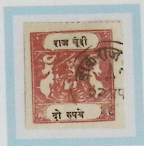
Like SG 46 2 rupees red-brown and black White pelure paper Type C inscription F2 forgery cliché C 22 April 1919