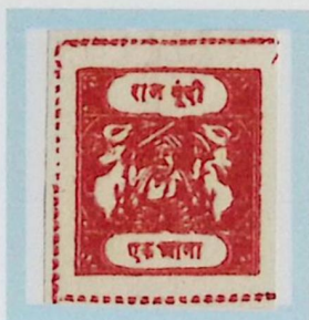
Like SG 63 1 anna scarlet-vermilion Appears like: thin white horizontal laid paper Type E inscription Cliché forgery like C Maybe photo. rather than typo. printing. Small thin top margin.