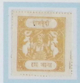
Like SG 50 2½ anna buff Thin white wove Type D inscription Cliché forgery like B Maybe photo. rather than typo. printing.