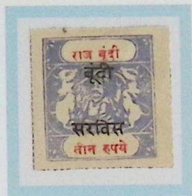
Like SG O25A 3 rupees blue and red- brown White medium wove paper Type C inscription, ovpt. O1 F1 forgery cliché A