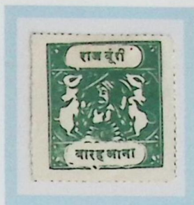
Like SG 44 var 12 annas myrtle-green vs. actual s/b sage-green White pelure paper Type C inscription F2 forgery cliché A