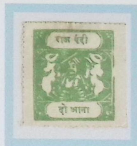
Like SG 29 2 annas emerald Toned white pelure paper Type B inscription F2 forgery cliché D