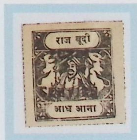
Like SG O16B ½ anna black White medium wove paper Type C inscription, ovpt. O2 F1 forgery cliché C