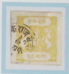
Like SG 21 2½ annas chrome-yellow White pelure paper Type A inscription F2 forgery cliché C 22 April 1919