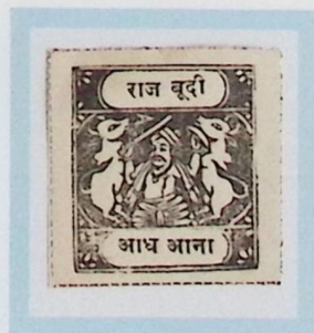
Like SG 38 ½anna black White medium wove paper Type C inscription F1 forgery cliché C