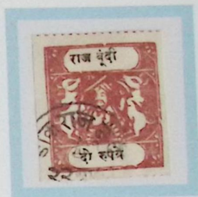
Like SG 46 2 rupees red-brown and black White pelure paper Type C inscription F2 forgery cliché B 22 April 1919