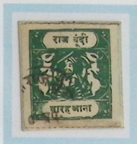
Like SG 44 var 12 annas myrtle-green vs. actual s/b sage-green Toned white pelure paper Type C inscription F2 forgery cliché B 7 April 1919 (on small piece of post card 7 April 1919 cds on back)