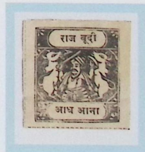
Like SG 38 ½anna black Toned medium wove paper Type C inscription F1 forgery cliché C