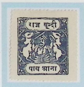
Like SG 73 ¼ anna ultramarine Medium white wove paper Perf. 11, Type H inscription Cliché forgery like D Maybe photo. rather than typo. printing.