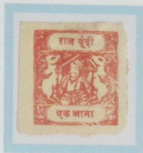
Like SG 39 1 anna orange-red White pelure paper Type C inscription F2 forgery cliché B