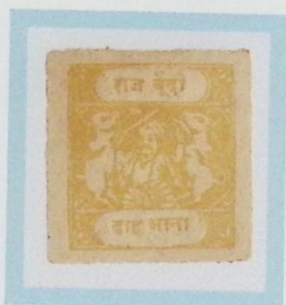
Like SG 21 2½ annas chrome-yellow Toned medium wove paper Type A inscription F1 forgery cliché B