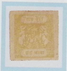
Like SG 21 2½ annas chrome-yellow Toned medium wove paper Type A inscription F1 forgery cliché C