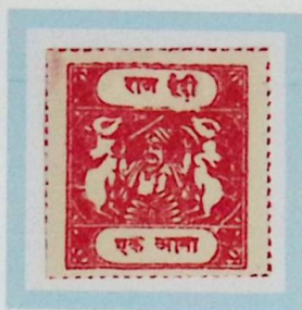
Like SG 28a 1 anna carmine Thin white wove paper Type B inscription Cliché forgery like C Maybe photo. rather than typo. printing.