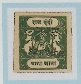
Like SG O22B 12 annas myrtle-green s/b sage-green Toned medium wove paper Type C inscription, ovpt. O2 F1 forgery cliché D