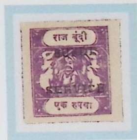
Like SG O23B 1 rupee lilac White medium wove paper Type C inscription, ovpt. O2 F1 forgery cliché A