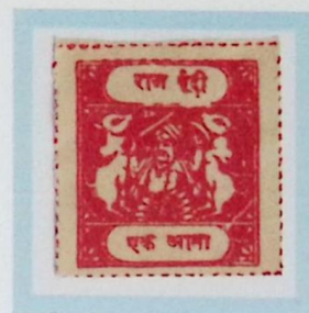
Like SG 28a 1 anna carmine Medium toned wove paper Type B inscription Cliché forgery like C Maybe photo. rather than typo. printing.