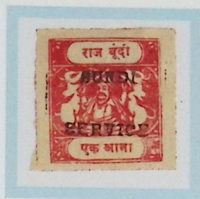
Like SG O17aB 1 anna carmine White medium wove paper Type C inscription, ovpt. O2 F1 forgery cliché C