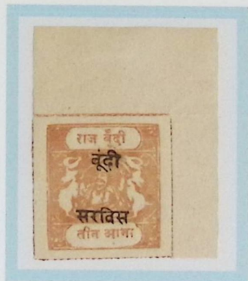
Like SG O3A 3 annas cinnamon s/b chestnut Toned medium wove paper Type A inscription, ovpt. O1 F1 forgery cliché B