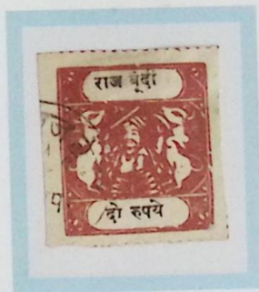
Like SG 46 2 rupees red-brown and black White pelure paper Type C inscription F2 forgery cliché B 22 April 1919