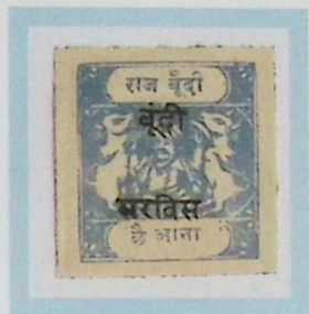
Like SG O4A 6 annas new blue s/b cobalt White medium wove paper Type A inscription, ovpt. O1 F1 forgery cliché B