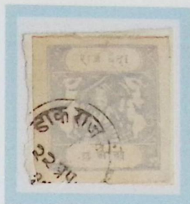
Like SG 24 6 annas cobalt White pelure paper on a small piece to cover minor damage to the forged stamp. Type A inscription F2 forgery cliché B 22 April 1919