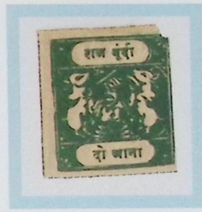
Like SG 40 2 annas myrtle green vs. actual s/b emerald (dam.) Toned medium wove paper Type C inscription F1 forgery cliché B