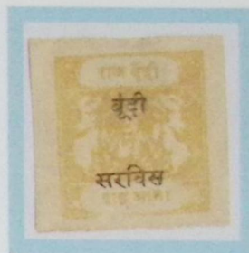
Like SG O2A 2½ annas stone s/b chrome-yellow White pelure paper Type A inscription, ovpt. O1 F2 forgery cliché C