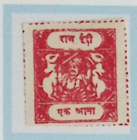
Like SG 28a 1 anna carmine Thin white wove paper Type B inscription Cliché forgery like C Maybe photo. rather than typo. printing.