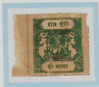
Like SG O18A 2 annas deep green s/b emerald Toned medium wove paper Type C inscription, ovpt. O1 F1 forgery cliché C