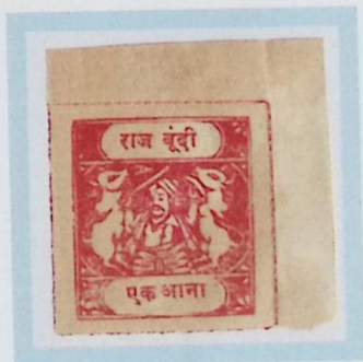
Like SG O17aA var. 1 anna carmine Toned medium wove paper ovpt. O1 on BACK F1 forgery cliché B