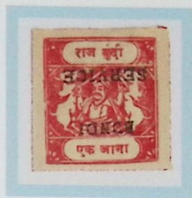
Like SG O17aB 1 anna carmine White medium wove paper Type C inscription, ovpt. O2