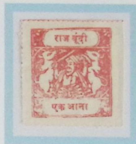
Like SG 38 1 anna orange-red White pelure paper Type C inscription F2 forgery cliché C