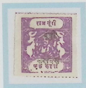
Like SG O23A 1 rupee lilac White pelure paper Type C inscription, ovpt. O1 F2 forgery cliché A