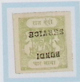
Like SG O19B 4 annas yellow green White medium wove paper Type C inscription, ovpt. O2 F1 forgery cliché C