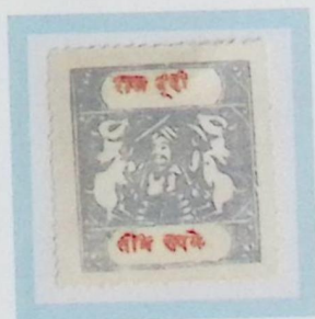
Like SG 47 3 rupees blue and red- brown White pelure paper Type C inscription F2 forgery cliché B