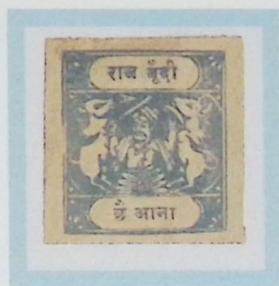
Like SG O4B var. 6 annas light blue s/b cobalt White medium wove paper Type A inscription, ovpt. O2 on BACK F1 forgery cliché D