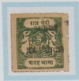
Like SG O22B 12 annas myrtle-green s/b sage-green Toned medium wove paper Type C inscription, ovpt. O2 F1 forgery cliché C