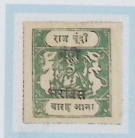
Like SG O22A 12 annas yellowish-green s/b sage-green Toned medium wove paper Type C inscription, ovpt. O1 F1 forgery cliché A