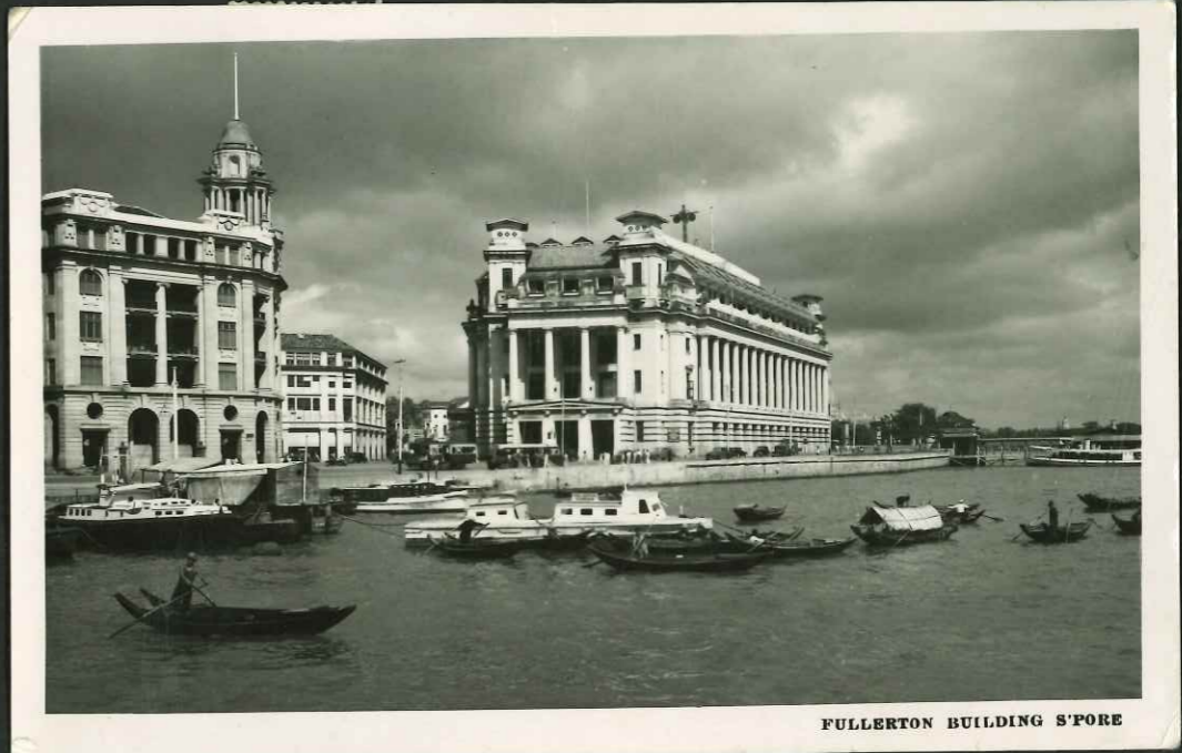
FULLERTON BUILDING S'PORE