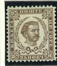
Wide (p. 10½, 11½)