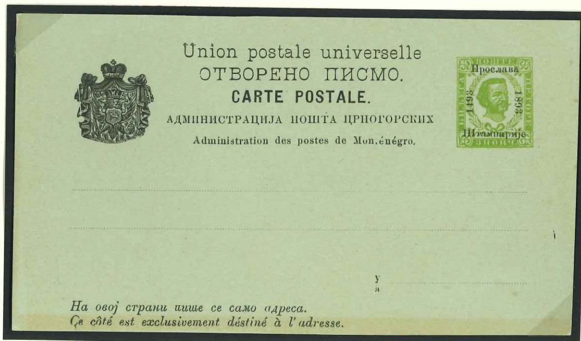
The two issued postal cards for inland (2 Novcic yellow) and foreign (3 Novcic green) use