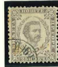
1874 (grey-purple, greyish brown)