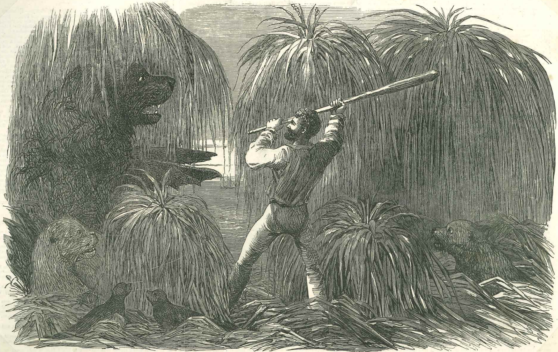
ENCOUNTER OF A SEALER WITH A SEA-LION, IN A TUSSAC BOG.