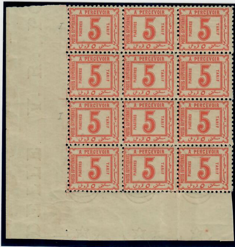
5pi. Corner marginal block of twelve from lower left of sheet. Top row Types I/II, second row Types III/IV.

7,000 stamps only were printed and this value was still being used concurrently with the next 1886 issue.