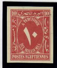
1927. 10m. rose lake imperforate on card paper under-printed 'Cancelled'. 800 printed.