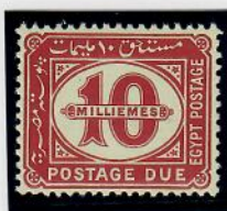
1922 Colour Changes..

Note that all three values had colour changes