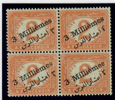
1898. 3m. on 2pi. orange.

The 1898 issue surcharge has no 'hamza' on the second last Arabic letter of the surcharge and is generally thinner in appearance.