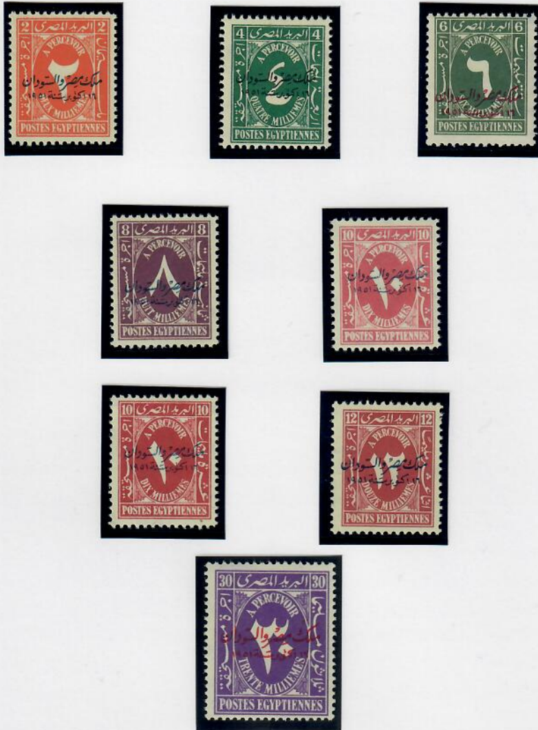
The set of eight values.

Issued on January 19 th 1952 remainders of the above issue were overprinted by typography at the Survey Department, Cairo in black, blue or red.