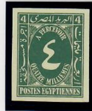
1929. 4m. blue green imperforate on card paper under-printed 'Cancelled'. 700 printed.