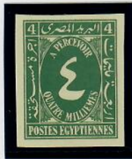
1927. 4m. yellow green imperforate on card paper under-printed 'Cancelled'. 700 printed.