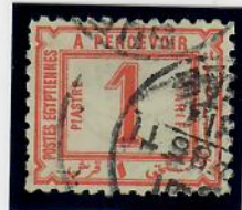
Used Reconstruction of the Four Types. I/II-III/IV.