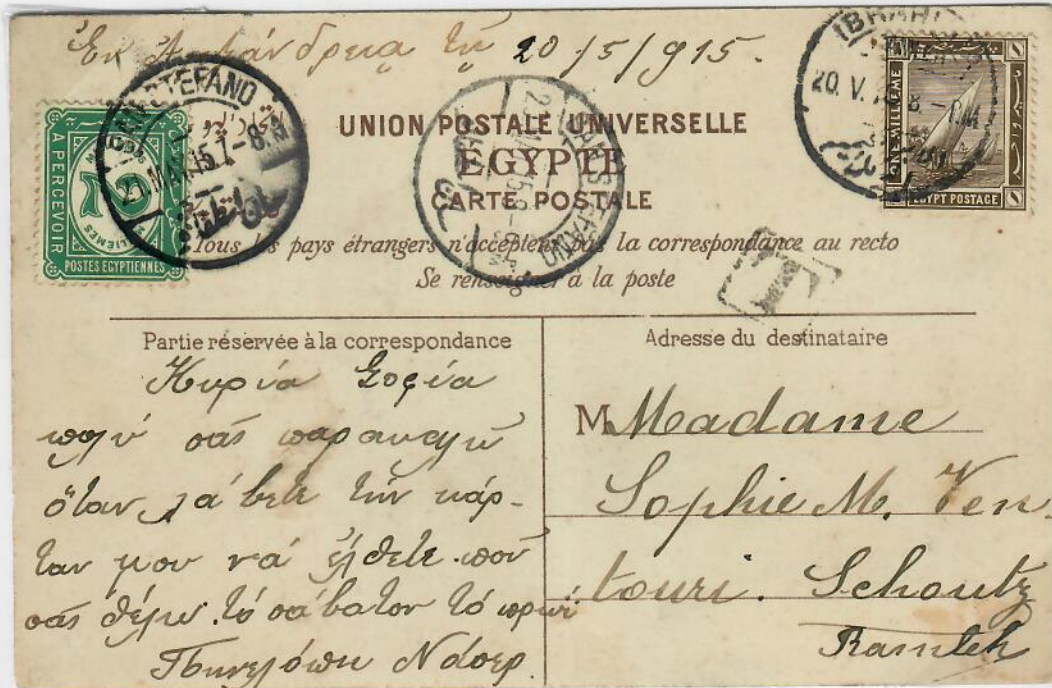
May 20 th 1915. Postcard to Ramleh Schutz franked by single 1914 1m. sepia underpaid usage from Ibrahimia, where 'T' mark applied, sent on to San Stefano Post Office. On arrival 1889 2m. green Postage Due applied and tied-deficiency of 1m. doubled.

2m. green value-usages on card and cover.