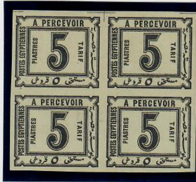
5pi. Proof block of four imperforate in black on un-watermarked paper.