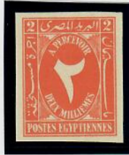
1938. 2m. red-orange imperforate on card paper under-printed 'Cancelled'. 700 printed.