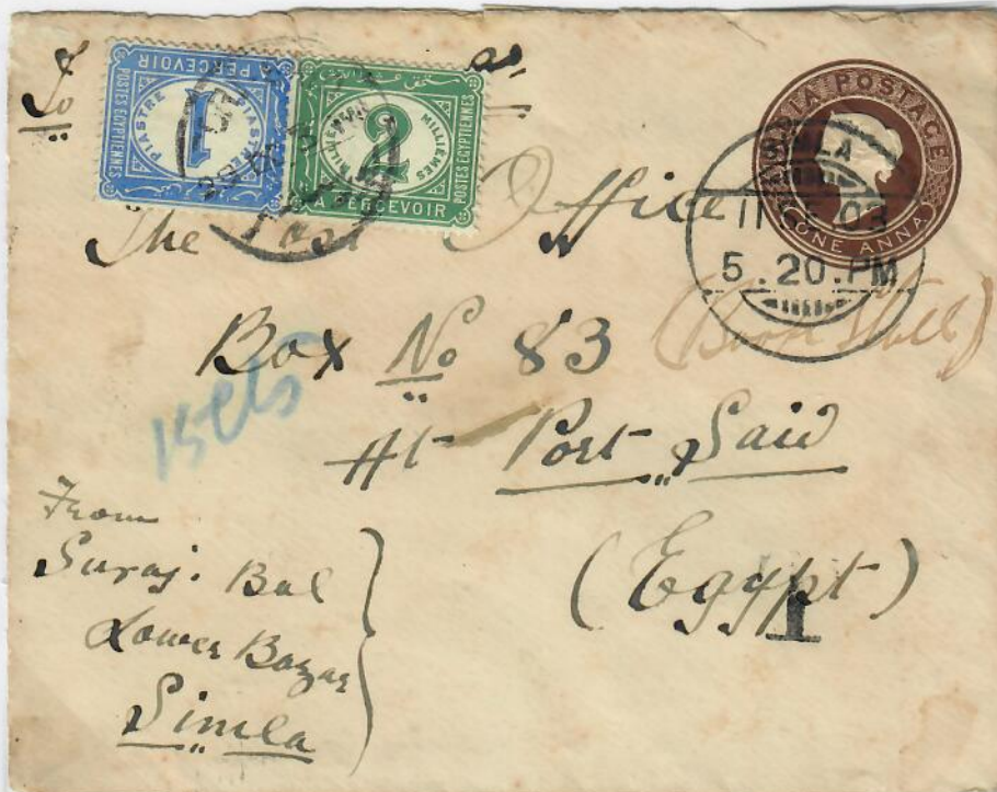
September 11 th 1903. India 1a. brown postal stationery envelope used from Simla to Port Said. On arrival taxed as Postage Due- manuscript 15 cents in blue crayon and 'T' (Tax) for UPU rate, taxed at Cairo (Sept 29 th ) with 1889 2m. green and 1pi. blue.