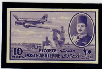
10m. deep violet Imperforate on thick card paper, under-printed 'Cancelled'. Probably 100 printed.