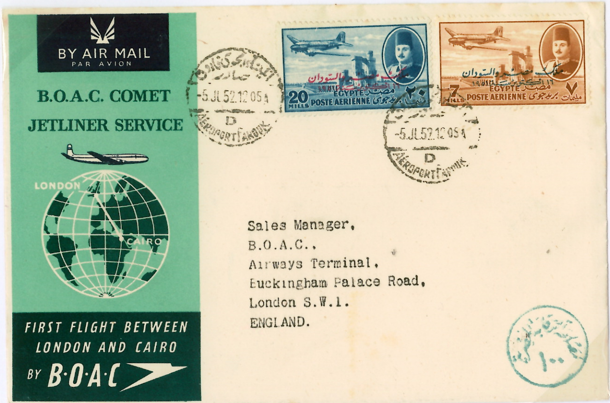
July 5 th 1952. BOAC Comet illustrated cover for First Flight from Cairo to London franked by 1952 Airmail 7m. and 30m. cancelled 'Aéroport Farouk' datestamps. BOAC Post Section datestamp on reverse dated the same day.