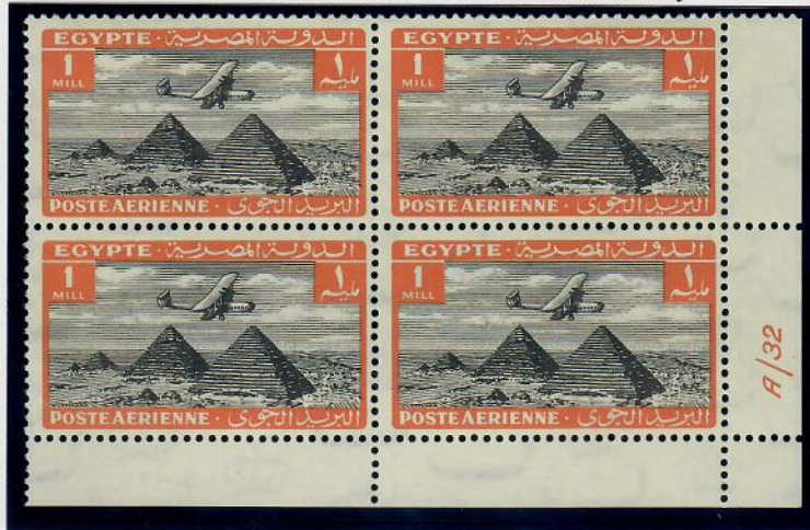
1m. black & orange. 1,607,500 stamps printed.

The issue was valid until the end of the Monarchy.