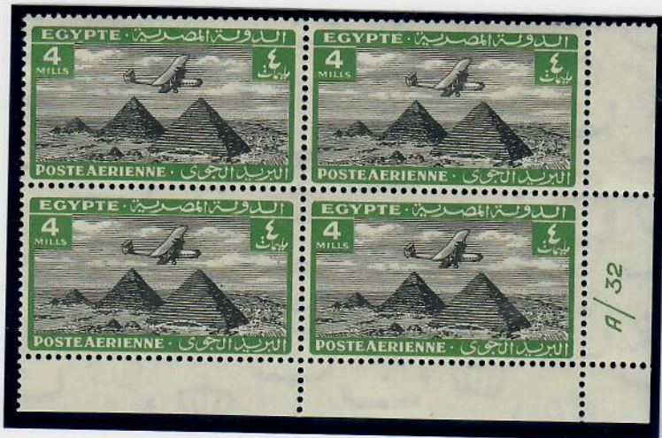
4m. yellow green & black. 330,000 printed.