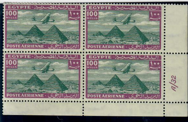
100m. green & violet. 335,000 printed.