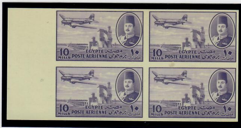
10m. pale violet Imperforate on thick card paper, block of four under-printed 'Cancelled' in Arabic. Probably 150 printed. There were 250 printed of the 10m. in both shades.