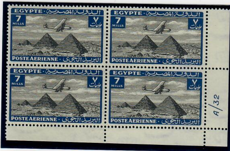
7m. black & blue. 285,000 printed.