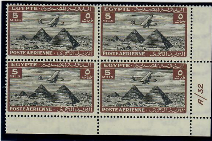
5m. black & chocolate. 2,105,000 printed.