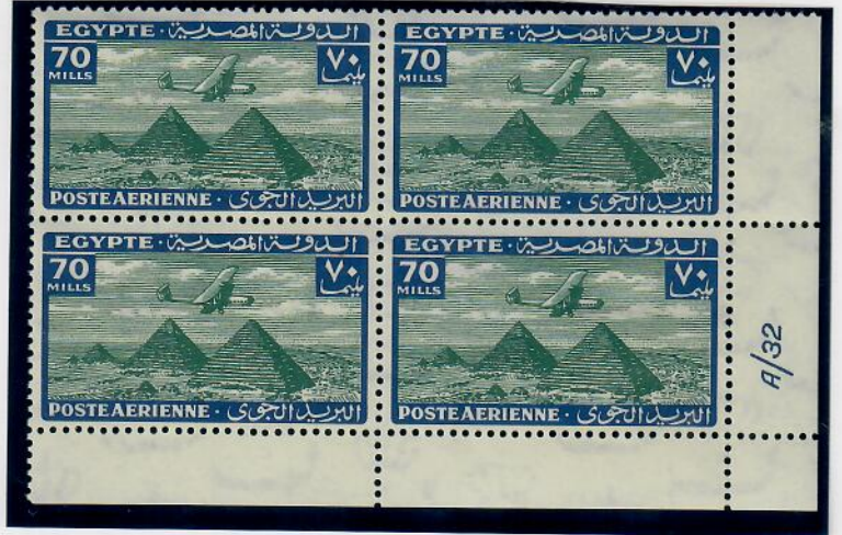
70m. green & blue. 235,000 printed.