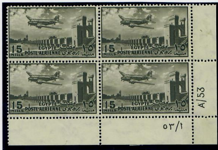
15m. bronze green. Control A/53. Two Controls were utilised.