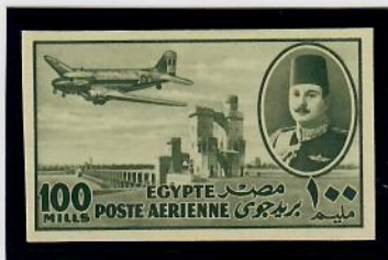
100m. olive. Imperforate on thick card paper under-printed 'Cancelled'. 150 printed.