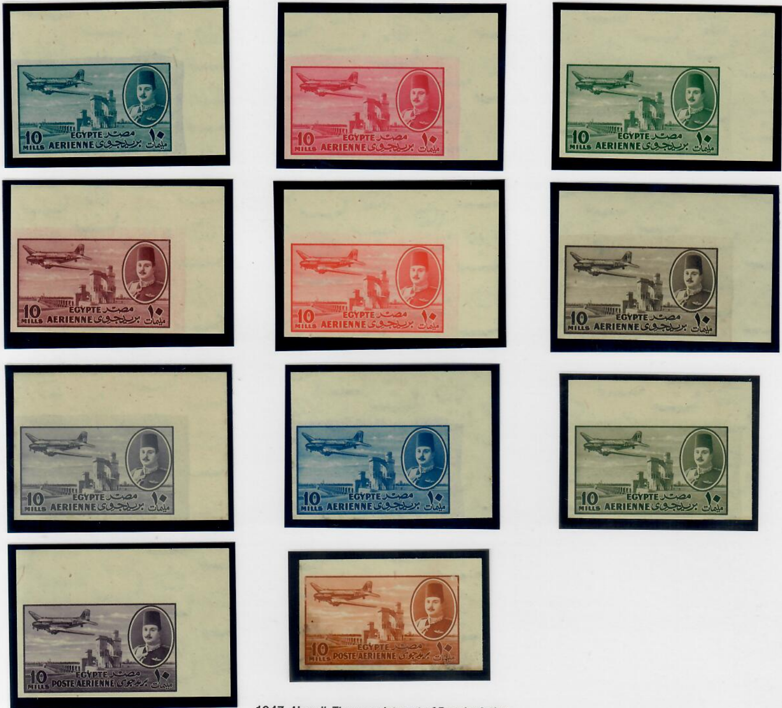
1947. Airmail. The complete set of Royal printing watermarked imperforate Colour Proofs, most from upper right of sheet.

There was only one sheet of nine stamps printed of each colour.