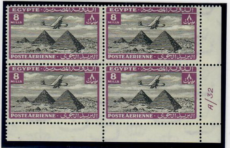
8m. black & violet. 1,730,000 printed.