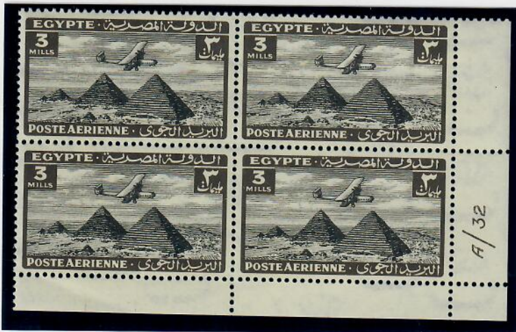
3m. black & sepia. 1,017,500 printed.