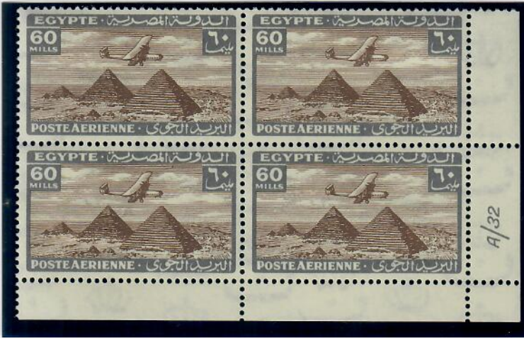
60m. sepia & grey. 225,000 printed.