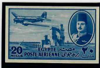
20m. bright blue. Imperforate on thick card paper, under-printed 'Cancelled'. 150 printed.