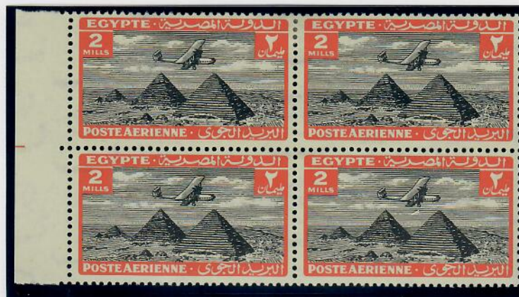
1938: 2m. black & red-orange. 162,500 printed.