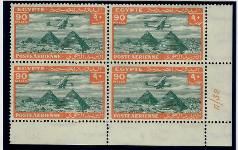
90m. green & orange. 230,000 printed.