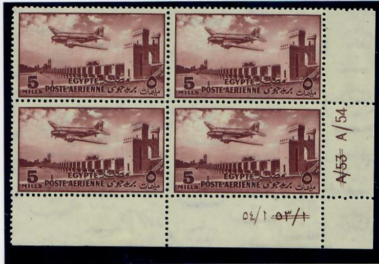
5m. red brown. Control A/54 on A/53. Five Controls were utilised.