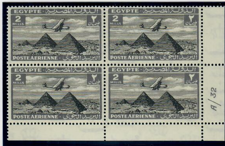
2m. black and grey. 440,000 printed.