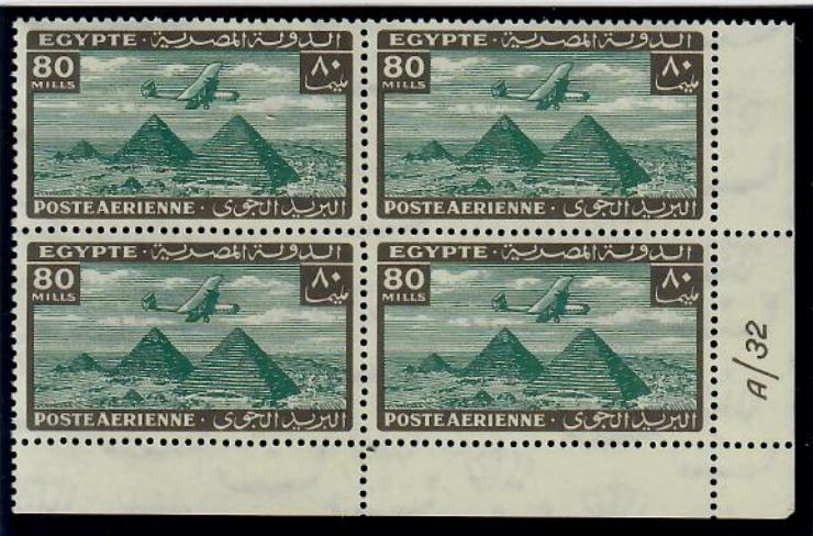
80m. green & sepia. 230,000 printed.