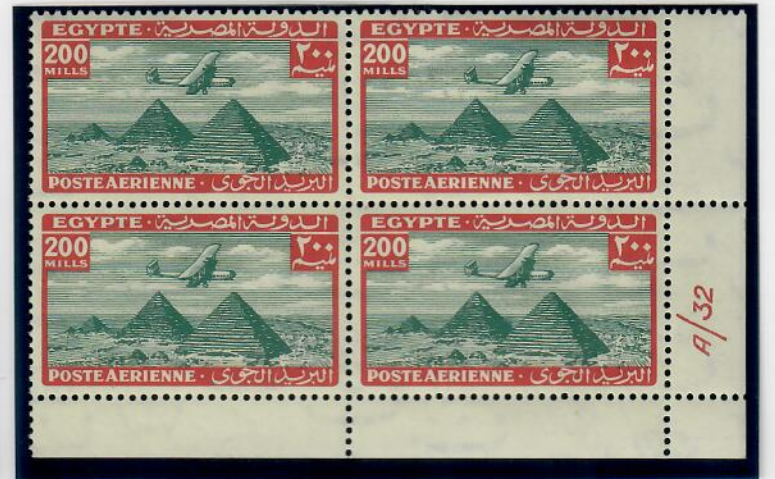
200m. green & dull red. 210,000 printed.

A/32 was the first Control Number utilised.