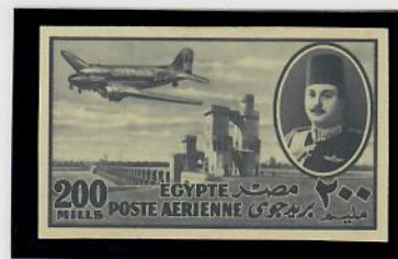
200m. grey. Imperforate on thick card paper under-printed 'Cancelled'. 150 printed.