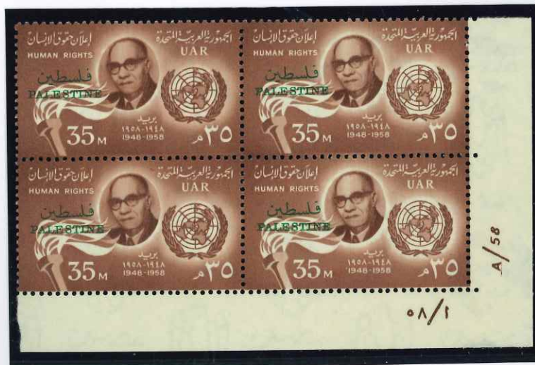
35m. red-brown. Control A/58. 200,000 printed.