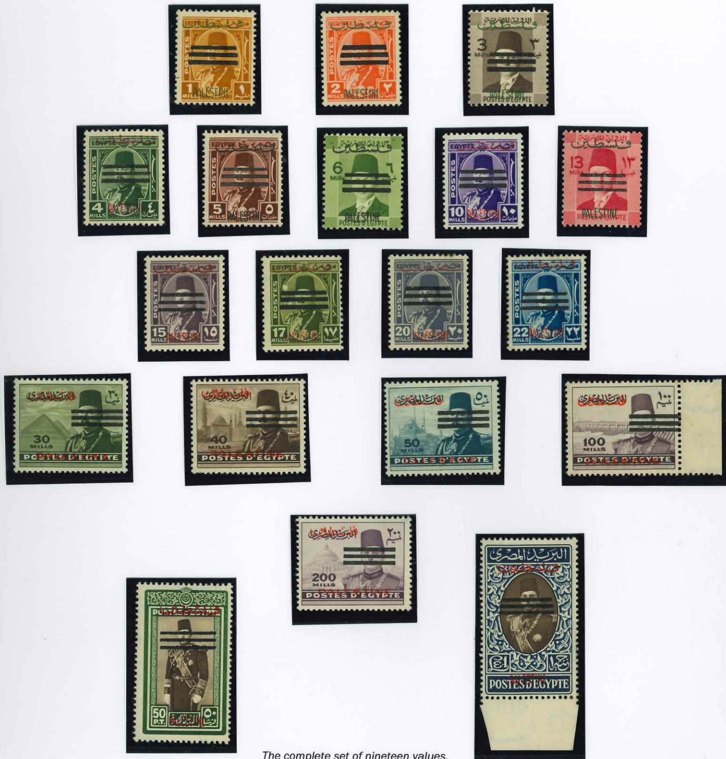
The complete set of nineteen values.

Issued on February 1 st 1953. Three Bars obliterating King Farouk's Portrait.