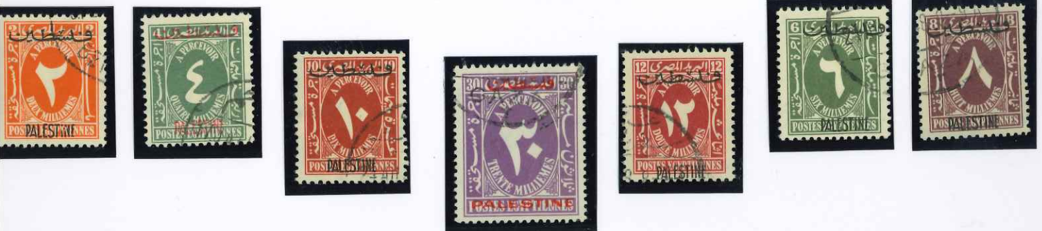
The set of seven used.

Note position 82 with 'three dots over Arabic A' variety.