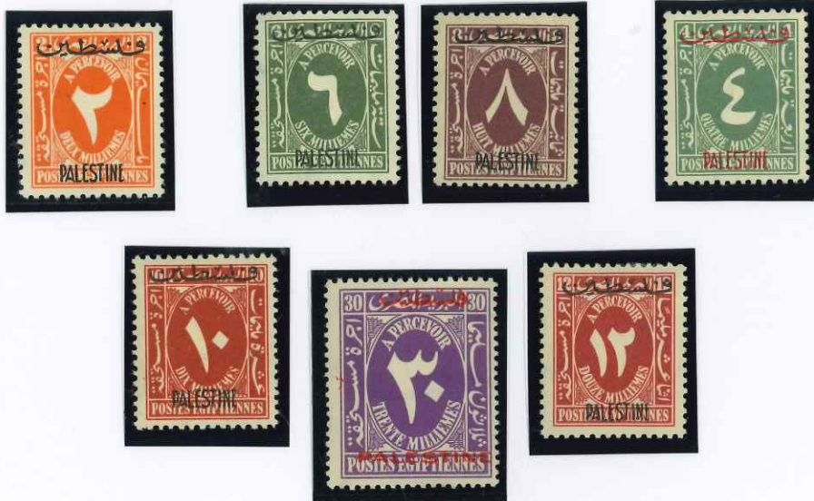
The set of seven values.

The overprinted set of seven values were issued on May 13 th 1948. Typographed overprint produced at the Survey Department, Cairo.