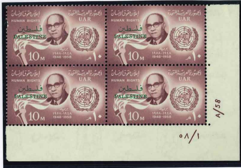
10m. reddish purple. Control A/58. 200,000 printed.

The overprint was applied by typography in green. Issued December 10 th 1958.