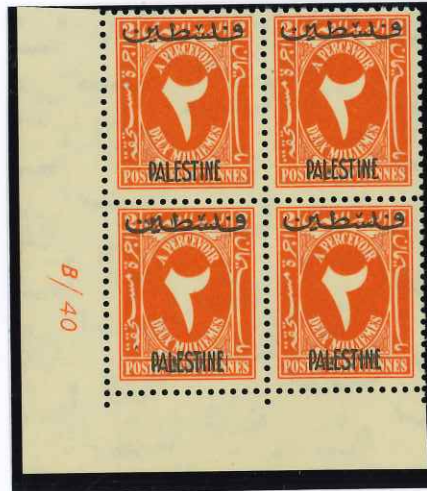
2m. vermilion. Control B/40.

Note position 82 with 'three dots over Arabic A' variety.