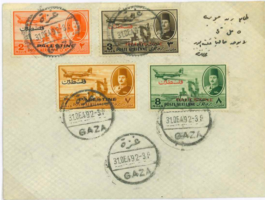
December 31 st 1949. Philatelic cover with 1948 Airmail 2m. vermilion, 3m. sepia, 7m. orange-brown and 8m. green cancelled by GAZA datestamps.