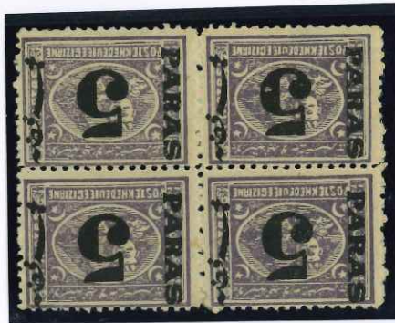
Block of the 5pa. on 2½pi., perf 12½. Watermark inverted. Note the blob on the figure '5' in surcharge on the lower left stamp, probably caused by a perforation punch-hole adhering to the plate.