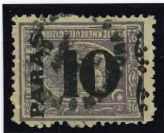
10pa. on 2½pi., perf 12½. Mansura March 10 th 1879.