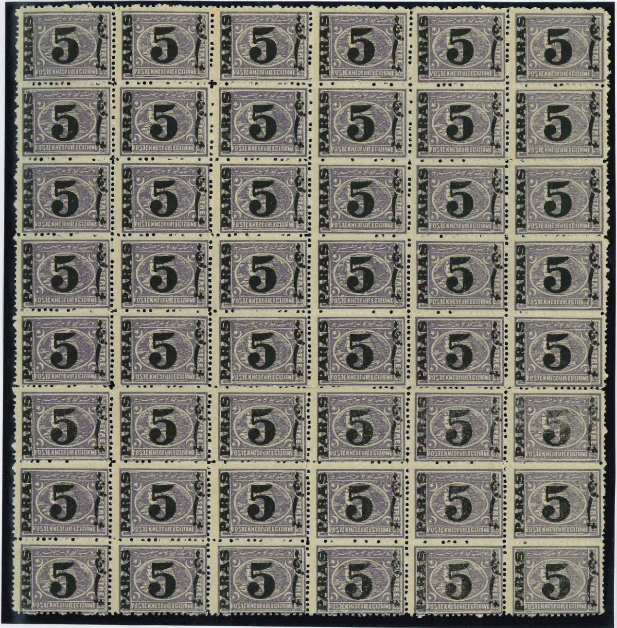
Block of forty eight. This perforation is much scarcer than catalogues suggest, whilst Smith states 'this perforation is much less common on the surcharged stamps'.