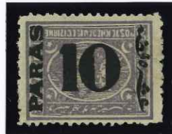
10pa. on 2½pi., perf 12½.