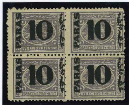
10pa. on 2½pi. violet. Perforated 12½.