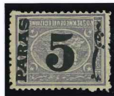
5pa. on 2½pi., perf 12½.

Both values and both perforation exist with surcharge inverted.