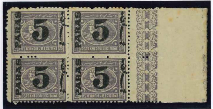
5pa. on 2½pi. violet. Perforated 12½.