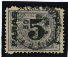
5pa. on 2½pi., perf 12½. Alexandria January 30 th 1879.