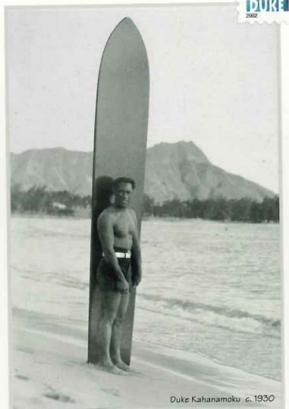
Duke Kahanamoku c. 1930