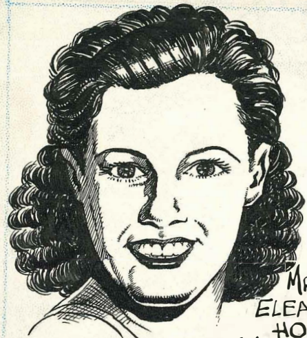
MRS. ELEANOR HOLM