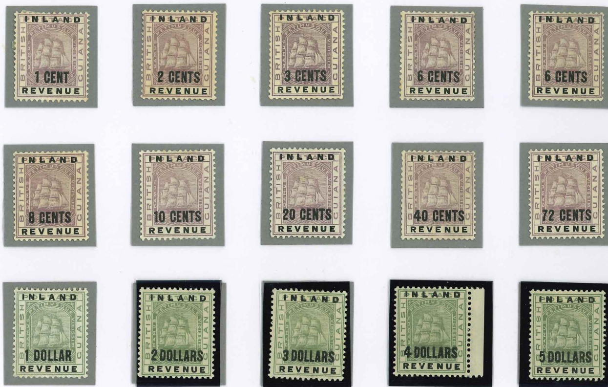
Setting Variety: Larger "4" in "4 CENTS"

Temporary issue by De La Rue for payment of revenue stamp duties but also usable for postage. Controversies arose as to the use of only two colours for several denominations, with the risk of confusion in dim light.