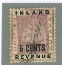
Setting Variety: Straight / clipped top of "6"