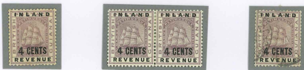
Se-tenant (at right) with normal