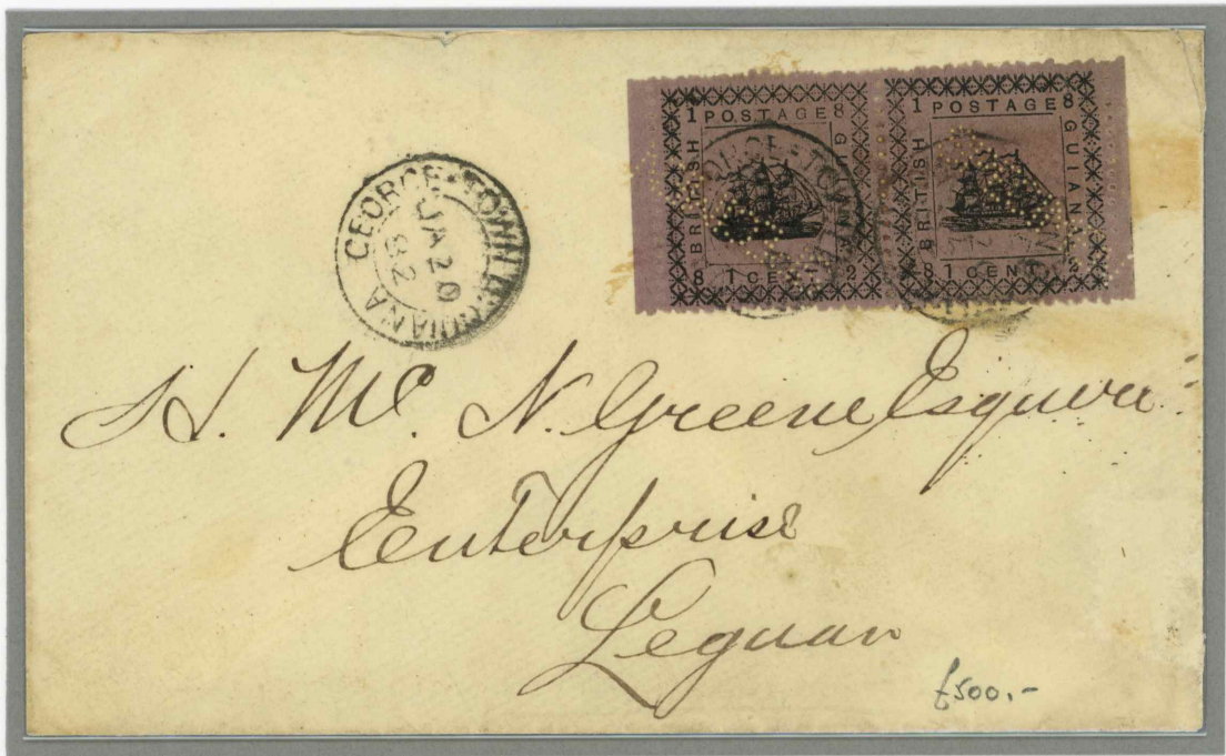
20 January 1882 - First Month usage from Georgetown (date stamps) to Enterprise, Leguan. Stamps are 2nd setting, positions 1-2 of the 5th or 7th printing, "Specimen" inverted at left stamp.