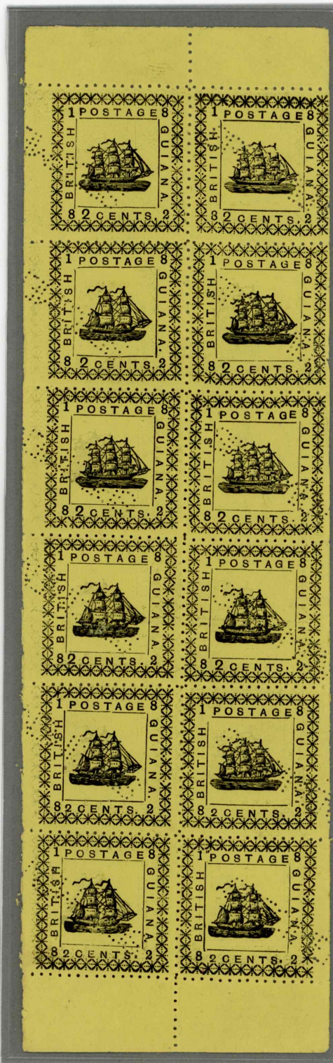
Double Impression, One Albino

2nd setting, 6th printing, showing "small 2" of "2 Cents" at positions 9-12. RPS cert.