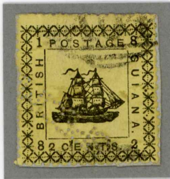
Small "2" in "2 Cents"

Two-masted ship, used. The "small 2" occurs at four positions in both settings.