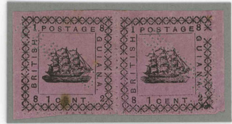
Pos. 5-6, 5th Printing, showing "dropped cross" at right of pos. 6