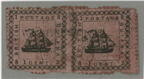
Pos. 7-8, 5th Printing, showing serifs at base of "1" at pos. 6