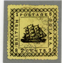
Large "2" in "2 Cents"

Three-masted ship, used. The "large 2" occurs at eight positions in both settings.