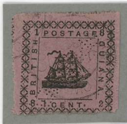
Pos. 6, 2nd Printing; note inverted "Specimen."