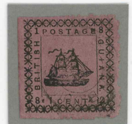
Two-masted ship, used

The word "SPECIMEN" is perforated diagonally, in the 3 x 4 setting reading upward from lower left to upper right, and in the 2 x 6 setting from upper left to lower right. Sometimes, half the stamps show the word inverted.