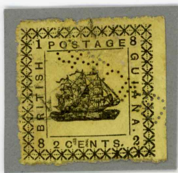
Small "2" in "2 Cents"

Three-masted ship, used. The "small 2" occurs at one position with this die in both settings, but only in printings 3, 4 & 6.