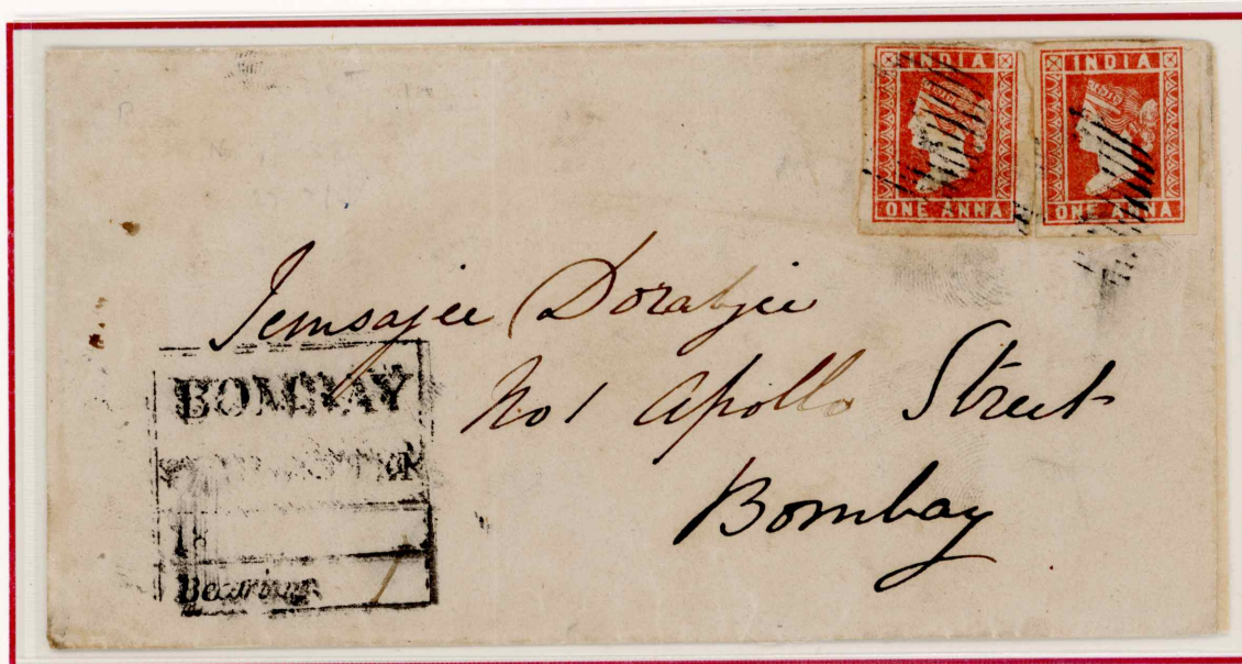
Rearguard mail, serviced in Bombay

The Persia Field Force Postal Unit returned to India with the main forces in March 1858. Thereafter, mail from the Rearguard was serviced in Bombay.