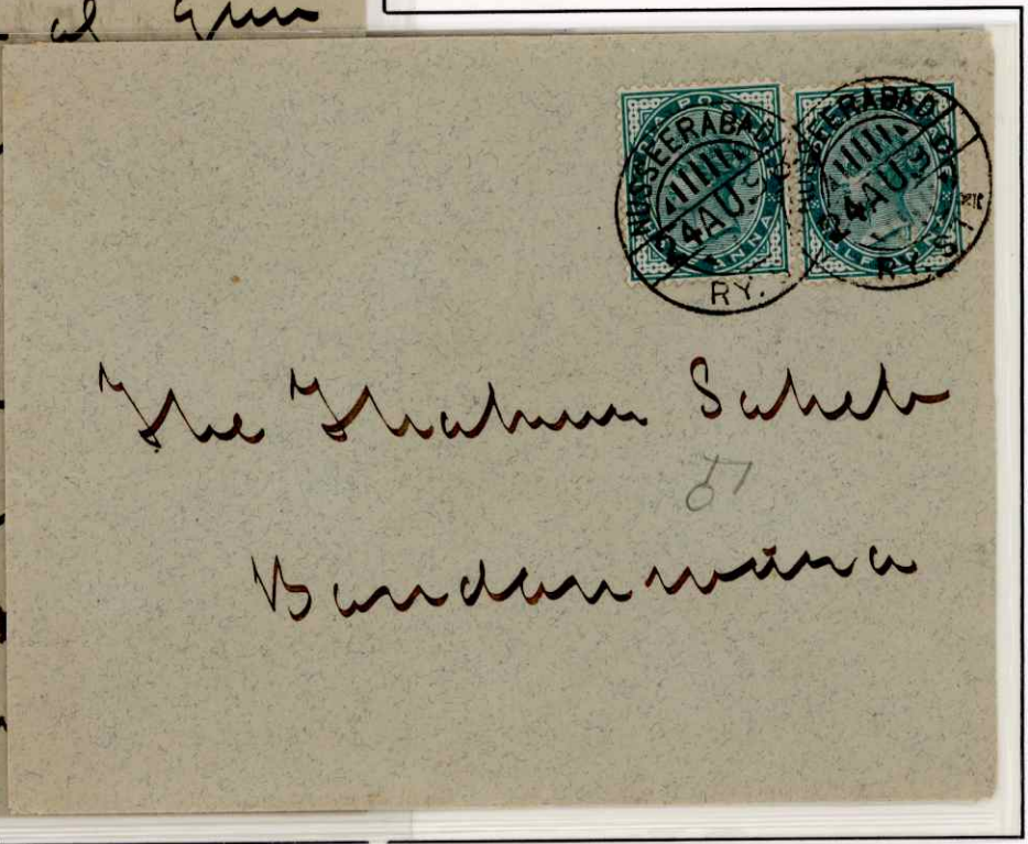
23 rd Bombay Rifles Kirkee, Persia