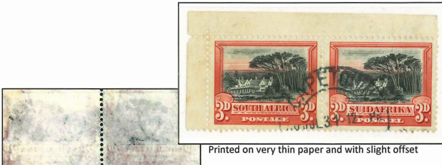
Printed on very thin paper and with slight offset