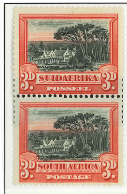
V1. Oval Perforations

Substantial downward shift of the vignette overlapping the frame, certainly one of the most prominent I have seen. 'They are not common as Waterlow were quality printers and poor color registrations were usually scrapped'