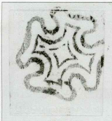
Digitally enhanced image to show the shape of the Maltese Cross more clearly.