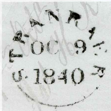
Digitally enhanced image to show the c.d.s. more clearly.