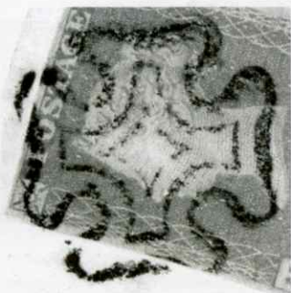
Stranraer 6 Sept. 1843 for comparison.