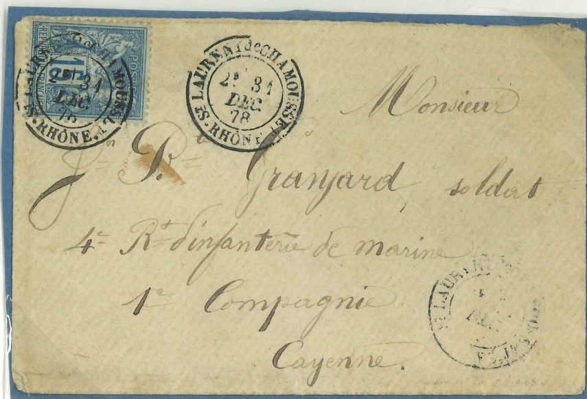
31 Dec. 1878, St Laurent de Chamusset (Rhône) to 4th Marine Inf. Regt. At Cayenne, Fr. Guiana illegible transit, no arrival backstamp

Same privilege accorded to families writing to the military overseas.