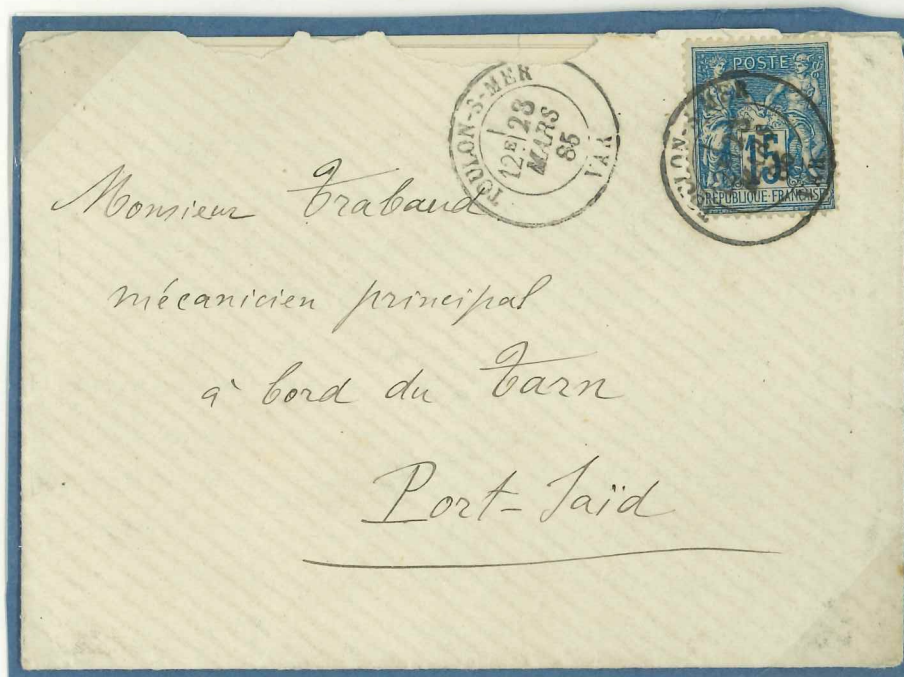
23 March 1885, Toulon-sur-Mer to sailor aboard the Tarn, at Port-Saïd, Egypt Marseille 29 March transit, no arrival backstamp