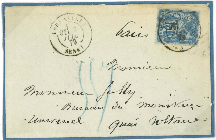
SÉNAT, 3 July 1879

These were moved to Paris November 1879, or by early 1880