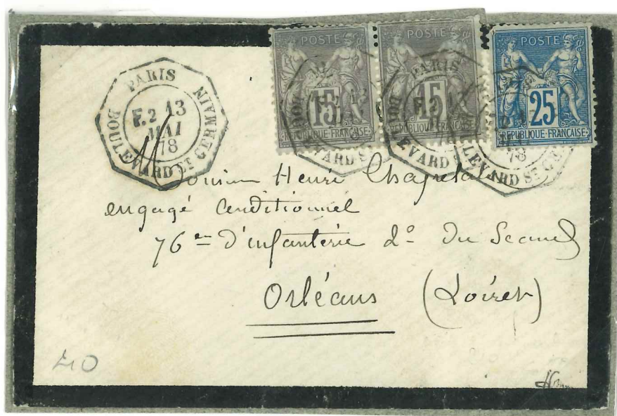
Paris, 2nd 15 minutes delay, 13 May 1878, to Orléans

1x letter = 25c 1st 15 mins. Delay = 20c postage (1 January 1876 Tariff) = 45c