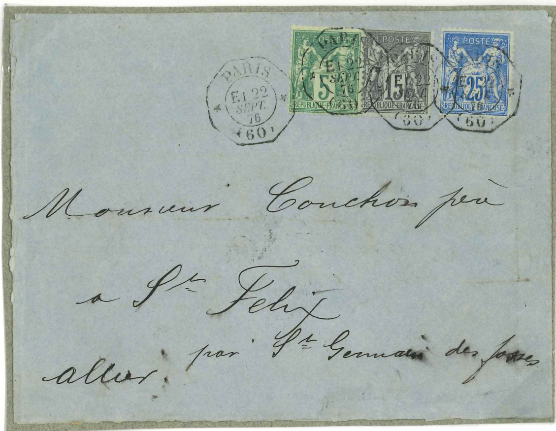
Paris (60), 1st 15 mins. delay, E 1, 22 Sept. 1876; [15c = Type I] backstamps of 22 and 23 September

1x letter = 25c 1st 15 mins. Delay = 20c postage (1 January 1876 Tariff) = 45c