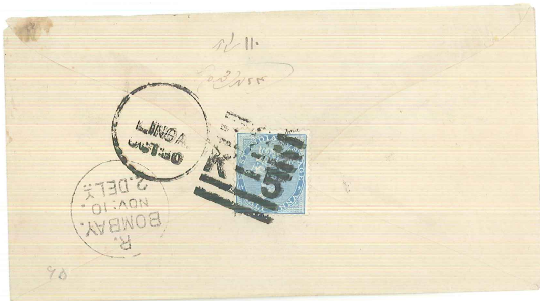
2-K-5 Duplex Linga Oct 30, 1879 Arrive Bombay Nov 10, 1879