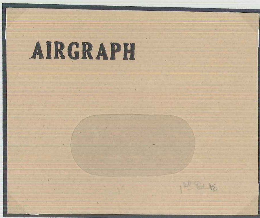
Unused Irish Airgraph envelope First type, issued in 1943