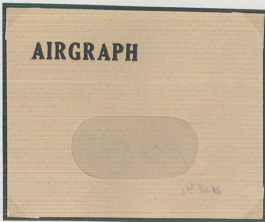
Unused Irish Airgraph envelope First type, issued in 1943