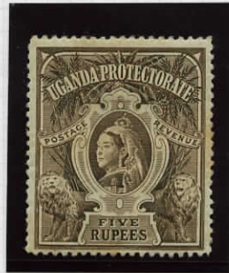
S.G. 91: 5r. brown

On 1 April 1901 the Postal Administrations of British East Africa & Uganda were merged 1902 (Feb.)