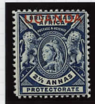
S.G. 93: 2 1/2 a. deep blue