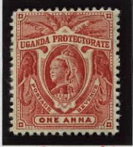
S.G. 84: 1a. scarlet