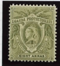
S.G. 88: 8a. pale olive