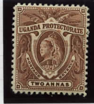
S.G. 86: 2a. red-brown