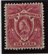
S.G. 84a: 1a. carmine-rose