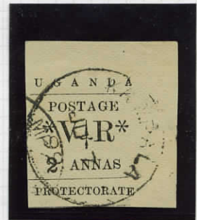
S.G. 56: 2 a. black (used)