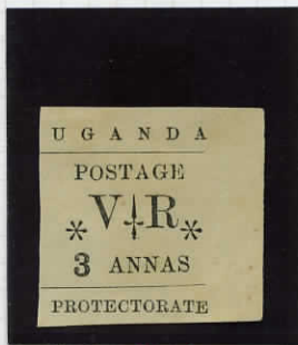
S.G. 57: 3 a. black