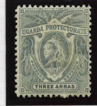
S.G. 87: 3a. pale grey