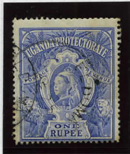
S.G. 90: 1r. dull blue (used)