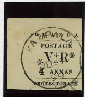
S.G. 58: 4 a. black (used)