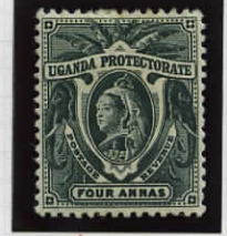
S.G. 88: 4a. deep green