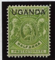
S.G. 92: 1/2 a. yellow-green

On 1 April 1901 the Postal Administrations of British East Africa & Uganda were merged 1902 (Feb.)