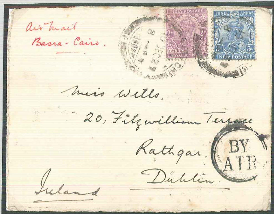
Posted Karachi on December 10, 1927, and carried by Basra - London airmail service. Forwarded to Dublin . Basra transit postmark of December 16. Circular BY AIR cachet in black applied to airmails without airmail etiquette. The London - Basra service was inaugurated by Imperial Airways on January 6, 1927.