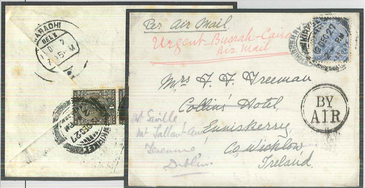
Posted Kirkee on December 12, 1927, and carried by Basra - London airmail service. Forwarded to Enniskerry . Karachi transit postmark of December 14. Circular BY AIR cachet in black applied to airmails without airmail etiquette. Indistinct ENNISKERRY arrival postmark on front.