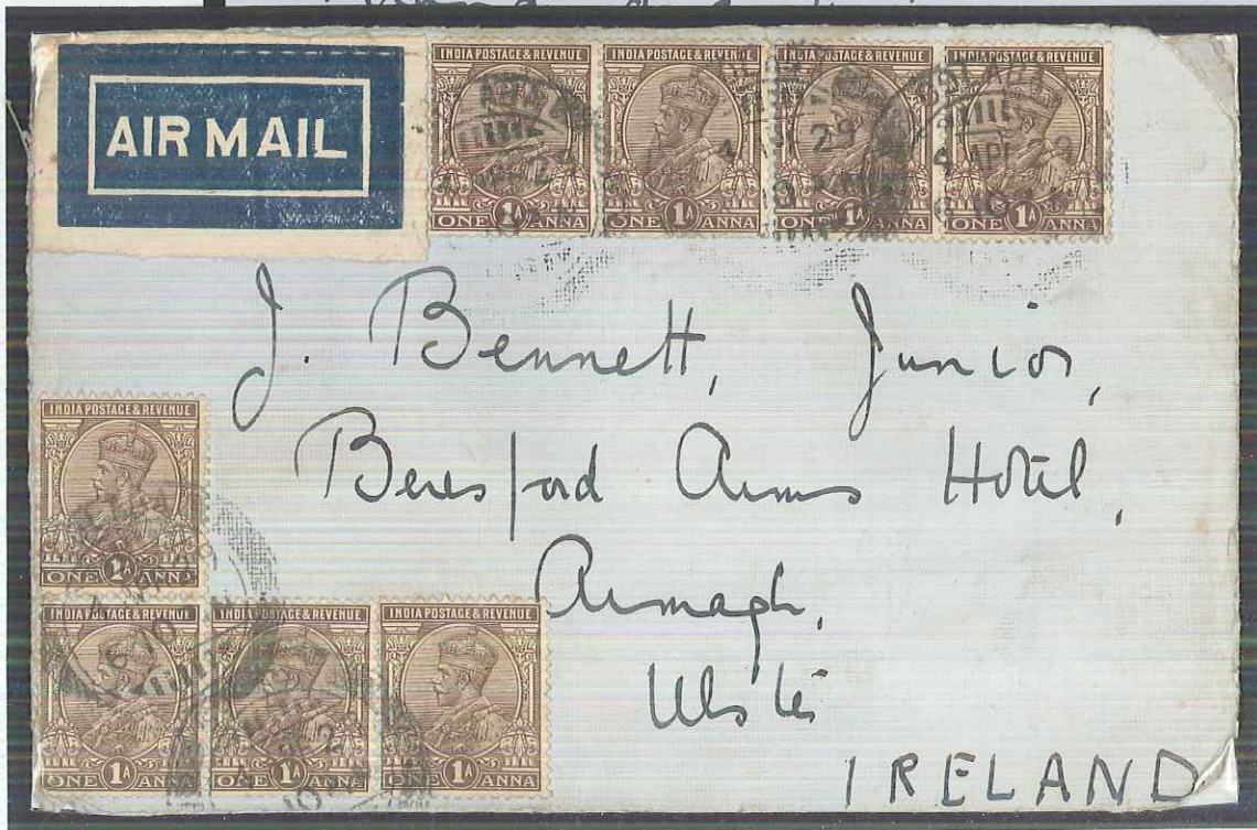
Posted COLABA, Bombay, on April 4, 1929, and carried on April 7 with first Imperial Airways service IW1 Karachi - Croydon. Croydon was reached on April 14. Forwarded to Armagh.

I am sending you an air mail letter so I know you will appreciate the lamp. I don't suppose you thought I would send me a letter by the air mail from England did I?