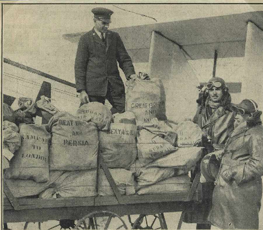
THE AFRICAN MAIL.—The first air mail from Central Africa on its arrival at Croydon yesterday. The journey of 5,114 miles took 9 days, a saving of 23 days compared with surface transport.

Posted Dar-es-salaam on March 7, 1931, carried Dar-es-salaam - Kisumu and on March 10 by first Imperial Airways service Kisumu - London . Forwarded to Dublin . PAR AVION / TANGANYIKA TERRITORY label in green.