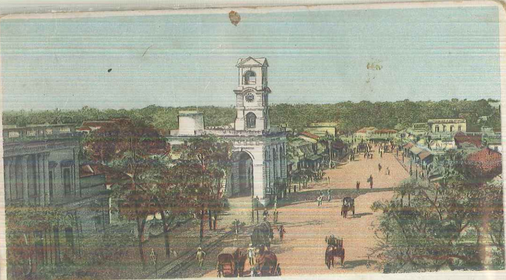
JAMES BAZAAR STREET, SECUNDERABAD.