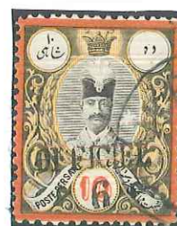
Perf 12 x 13