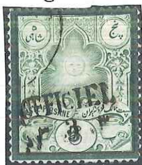
Perf 13 type A