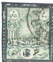
Perf 12 type B