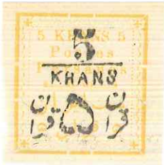
Forgery No 1