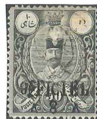
Perf 12 x 13