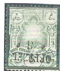
Perf 12 x 13 A