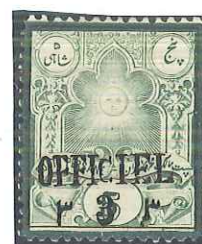
Perf 12 x 13 A