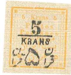
No genuine ever seen