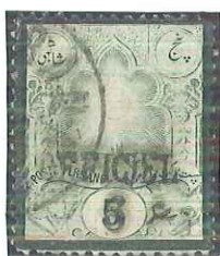
Perf 12 type A