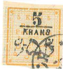
Forgery No 2