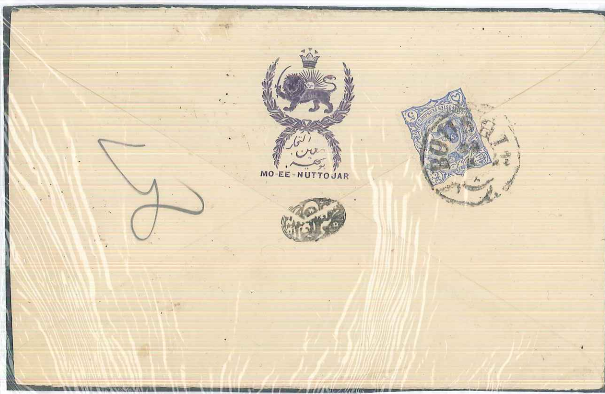
1897 Provisional issue.

After the assassination of Nasser-ed-din his fourth son Mozaffar-ed-din became shah