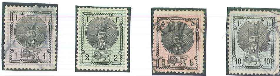
D. perf 12½ -13