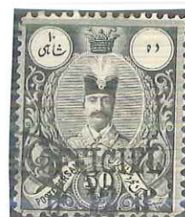
Perf 12 x 13.