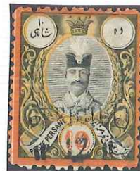
12 on 10 ch of 1882