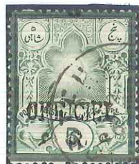
Perf 13 type A