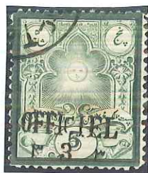
Perf 12 type A