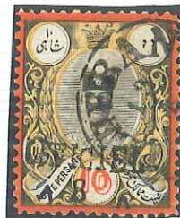
8 on 10 ch of 1882