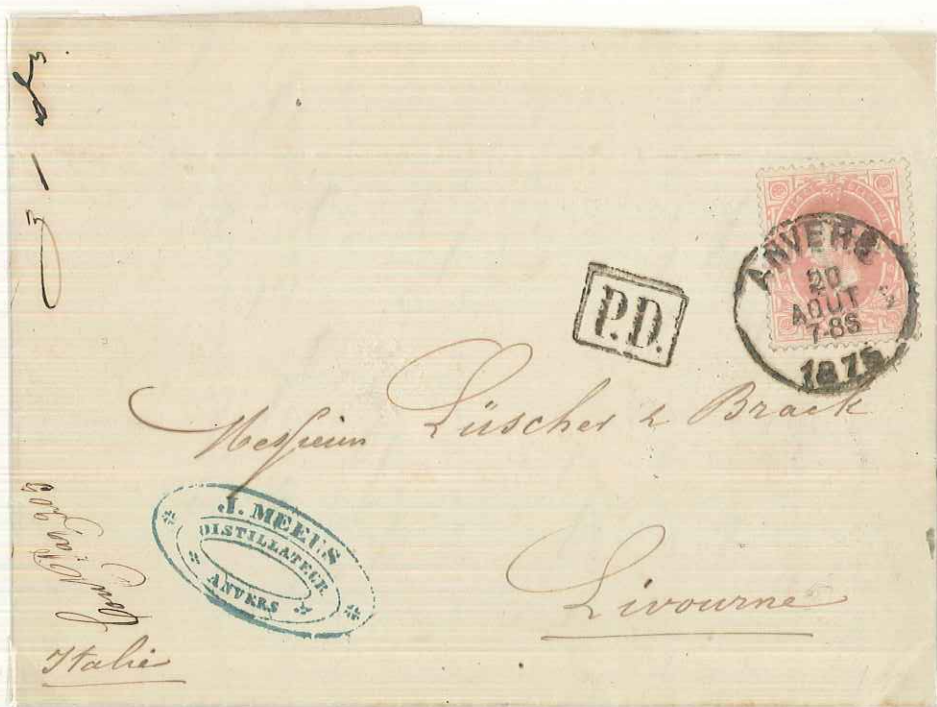
A letter from Anvers to Livorno, Italie, August 20, 1875. Franked by pale salmon 40 cent stamp. On the back an arrival CDS, Livorno, August 23, 1875.