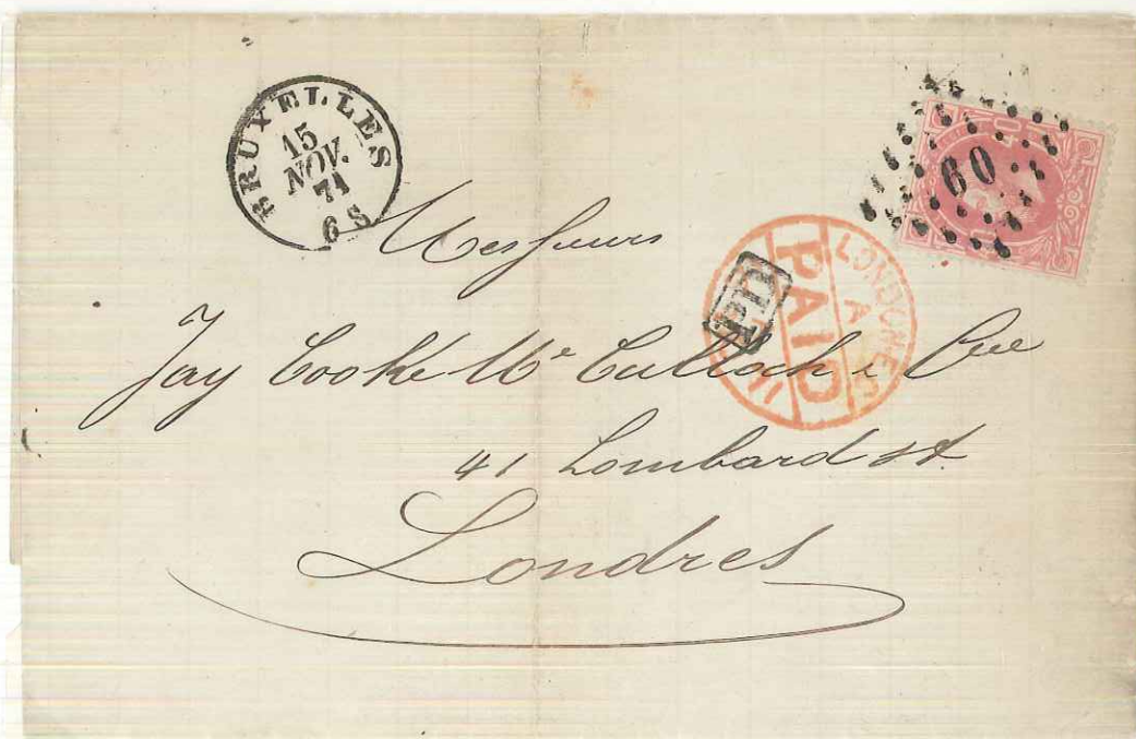
A letter from Bruxelles to London, November 15, 1871. Correctly franked by pale red-carminé stamp perforation 15.