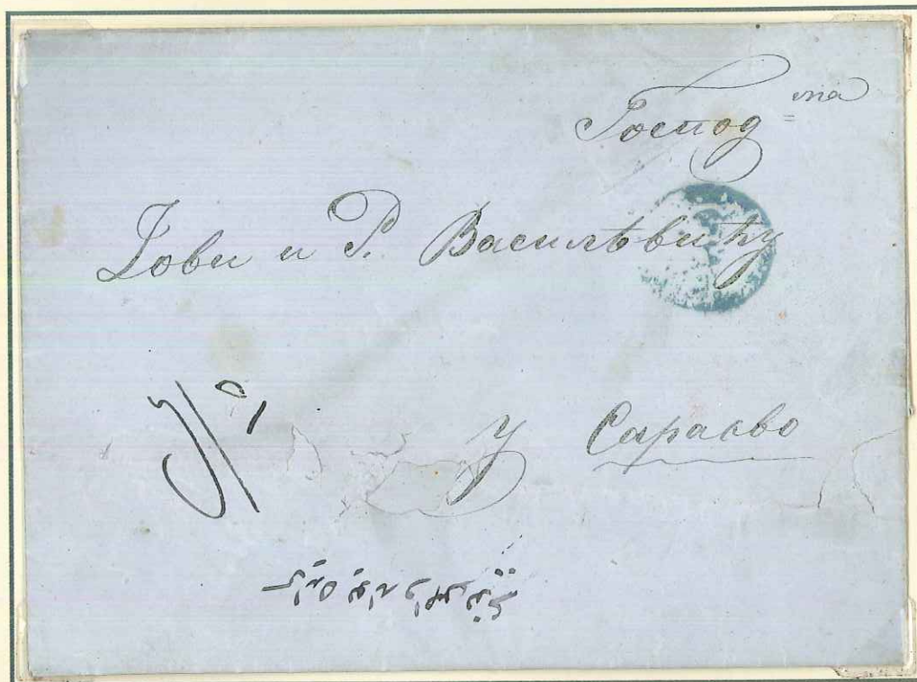
A pair of covers from the pre-stamp period both sent from Mostar to Sarajevo, the one above in 1859, the one below in 1860.