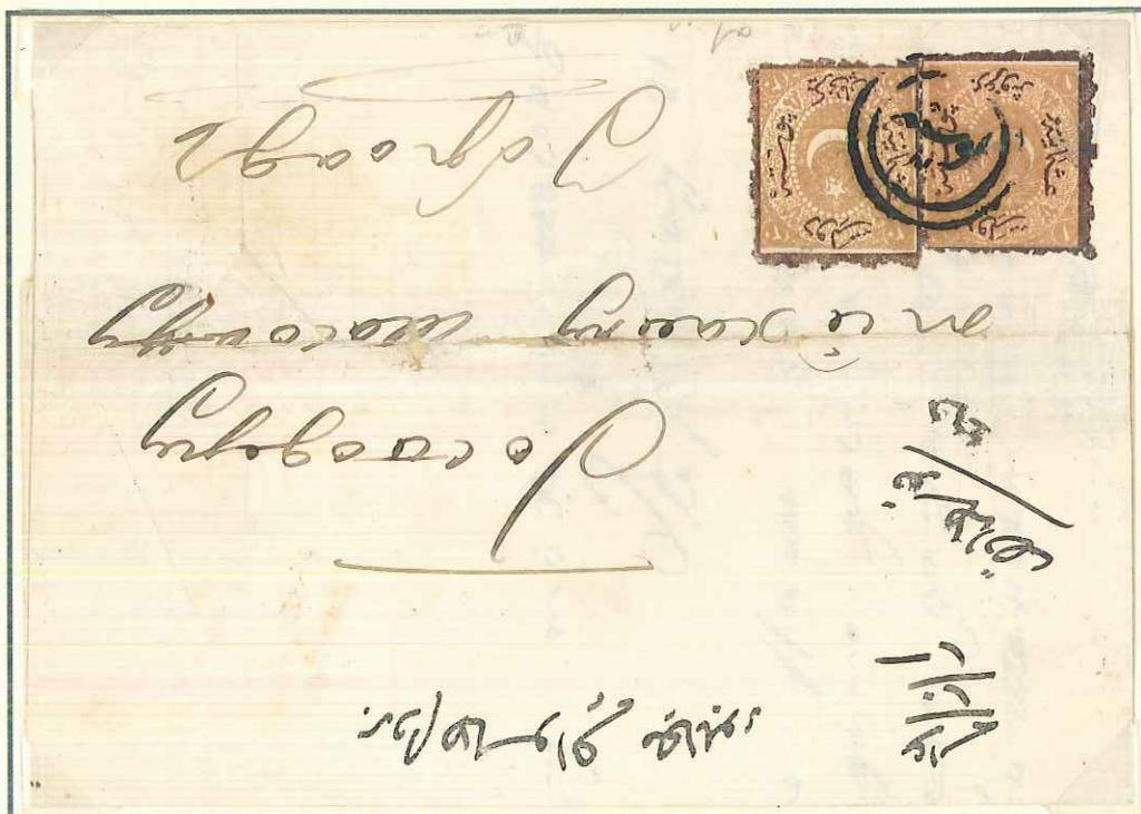
Entire from 1875 from Sarajevo to Brod franked with 1870 20pa and 1 Pi making up the rate for up to 3 Dirhem weight and a distance of up to 100 hours (1868).