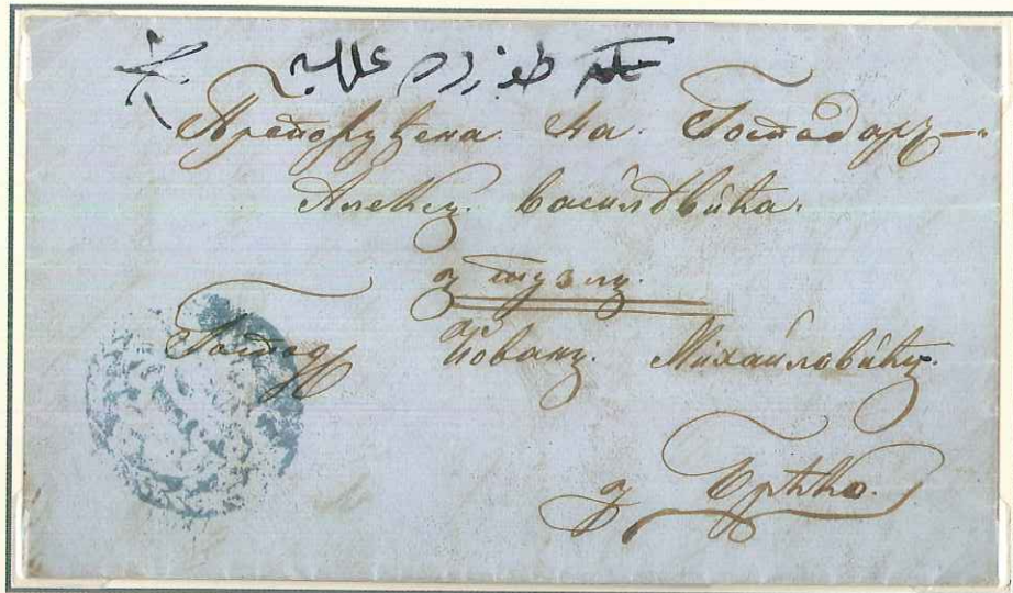
Entire of 1860 sent from Sarajevo to Tuzla for forwarding to Brecka. Strike of Sarajevo seal.