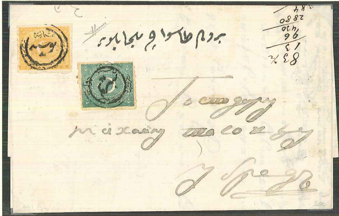
ENTIRE LETTER WRITTEN IN BOSNA (SARAJEVO) ON 14TH APRIL 1872, ADDRESSED TO BROD, FRANKED WITH (1871) 20PA. GREEN + 1PI. YELLOW, CANCELLED DOUBLE-CIRCLE ALL ARABIC 'BOSNA' (C/W FIG 5.) CERTIFICATE S. SORANI (1982).