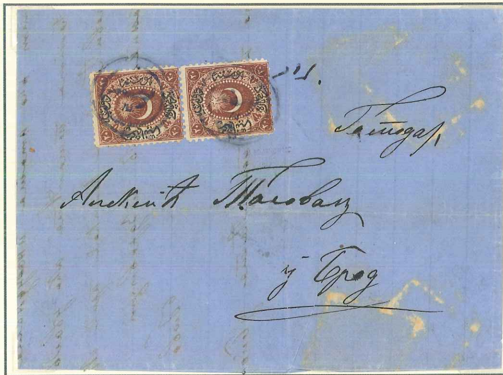
Entire from 1867 from Sarajevo to Brod franked with a pair of 1865 20pa making up the making up the rate for up to 3 Dirhem weight and a distance of up to 100 hours (1863).