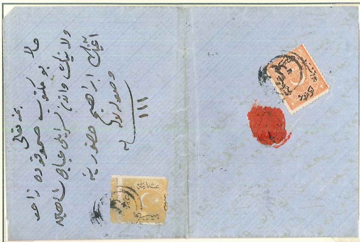
Undated entire Sarajevo to Constantinople franked with 1Pi yellow and 2Pi red of 1868 paying the 3 Gurush rate for up to 200 hours distances (1863).