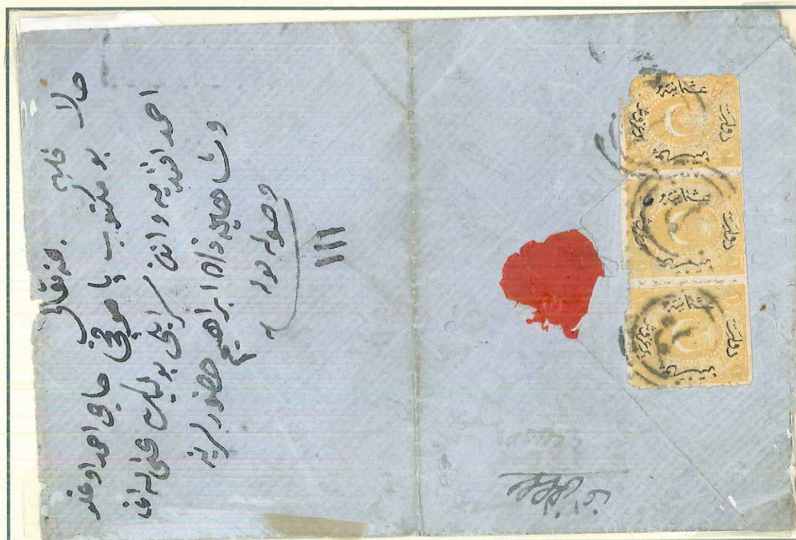
Undated entire from Sarajevo to Felibe franked with strip of 3 of the 1870 1 Pi issue, making up the 3 Gurush rate for up to 200 hours distances (1863).