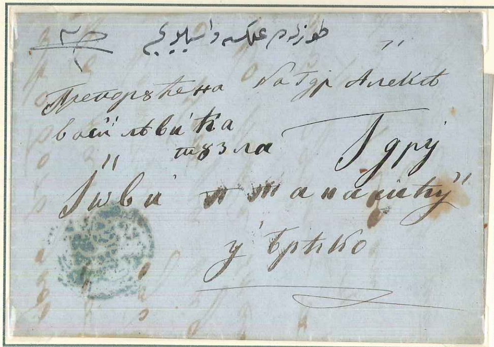
Entire of 1860 sent from Sarajevo to Brecka. Strike of Sarajevo seal.