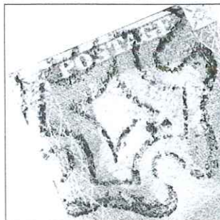
Digitally enhanced image of the cross in question.

* SG lists the Whitehaven Special cross only on the 1841 1d Red-brown from Plates 12 onwards (SG Spec. suffix 'tw'). However, examples of the 1840 1d Black and 1d Red-brown printed from the black plates obliterated by the Whitehaven Special are illustrated in Rockoff & Jackson.