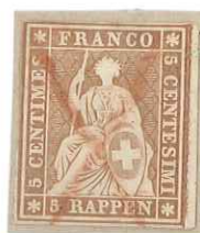
Brown Crayon Doe Brown