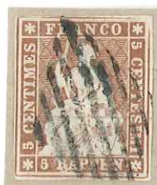
9-Bar Grill Dark Brown