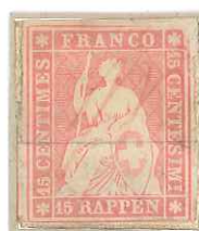
Red Pen Cancel