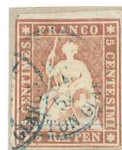
Blue CDS Gray-Brown