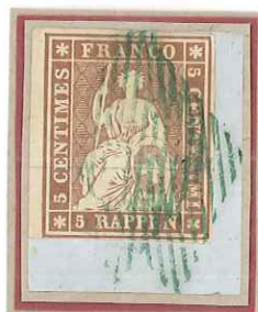
Green Grill Matte Brown