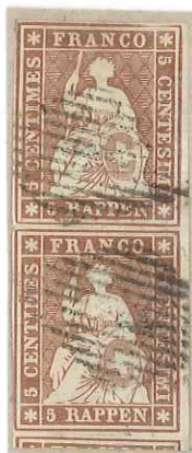
13-Bar Grill Deep Reddish Brown