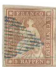
15-Bar Grill Dull Brown