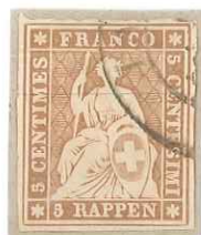
Black CDS Yellow-Brown