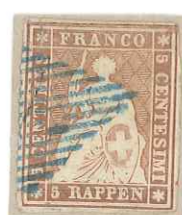
16-Bar Grill Dull Brown