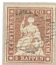
15-Bar Grill Gray-Brown