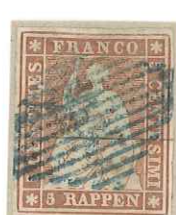
15-Bar Grill Light Brown