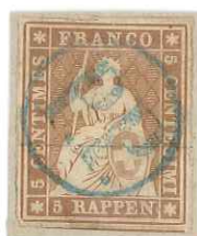
Blue P.P. Gray-Brown