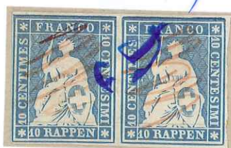
Olive-Yellow Thread Not submerged in the blue vat to produce the emerald color.