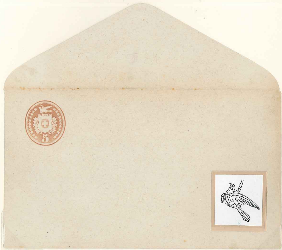
Dove control mark facing up. Envelope's earliest recorded use Nov. 7, 1871.