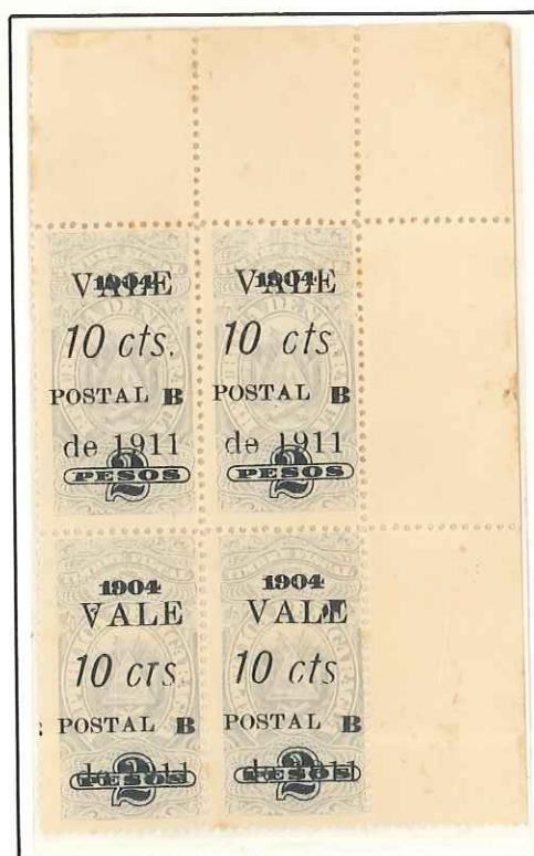
Corner block of 4 showing the variety NO stop