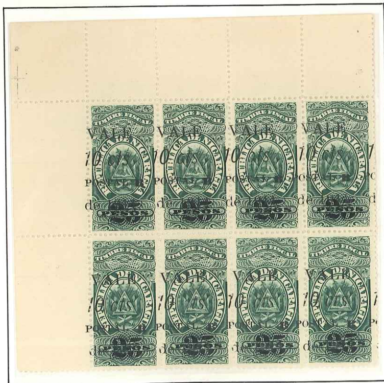
Corner - block of 8 stamps with shifted overprint and variety NO stop