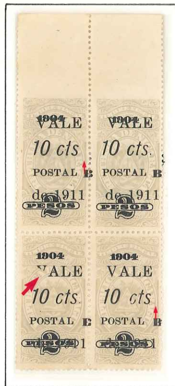
Block of 4 with varieties NO stop and broken V

Surcharged revenue stamps with additional overprint 1904 in black