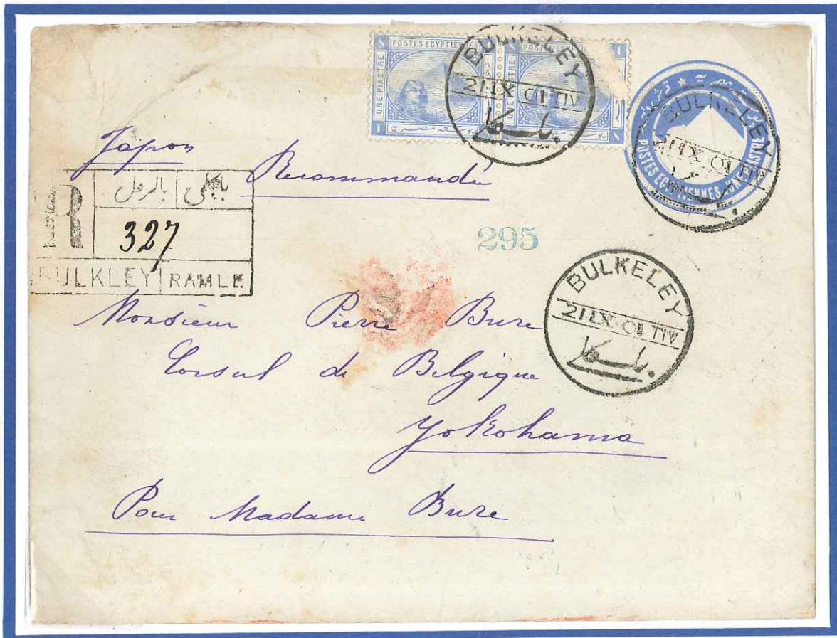
21 SEP 1901 Stationery registered cover sent from BULKELEY (ALEXANDRIA ) to YOKOHAMA on 26 OCT 1901. Via ALEXANDRIA & SUEZ one the same day. And COLOMBO 4 OC 01, Bearing G.P.O. HONG KONG c.d.s. dated 15 oc 01. Transit time 35 days. Paid 3 Piastres one for registered and double weight stage. , covering the postal rate of destination.