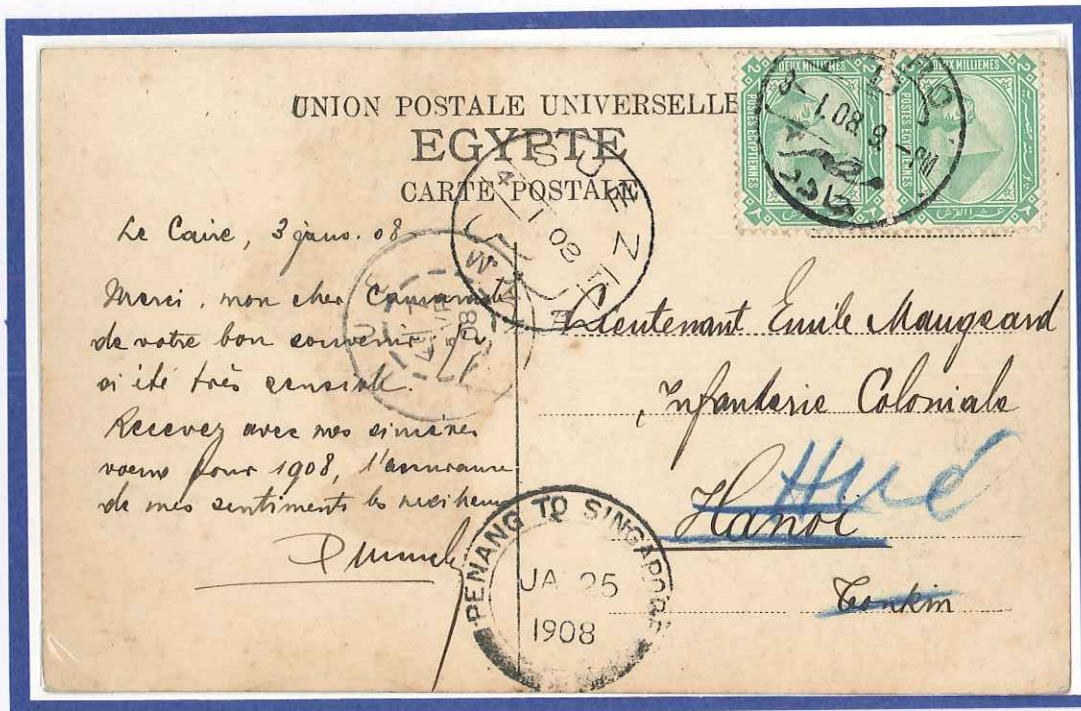
3 JAN 1908 postcard sent from CAIRO to HHUE (VIETNAM) on 5 FEB 1908 by S.S. "TEESTA" Via SUEZ one dated 4-1-08. With "PENANG TO SINGAPORE" c.d.s.25-1-08. Transit time 32 days. Paid 4 Mills/ postcard. , covering the postal rate of destination.