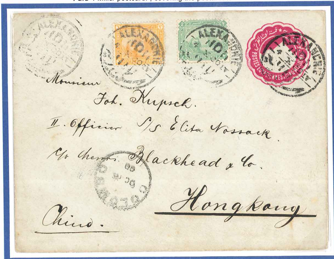
4 OC 1900 Stationery cover sent from ALEXANDRIA to HONG KONG CHINA on 1 NO 1900. Via SUEZ one the same day. And COLOMBO 15 OC 00, An officer on board by S.S. "ELIZA NOSSACK" at HONG KONG c.d.s. dated 1 NO 1900. Transit time 35 days. Paid One Piastre. , covering the postal rate of destination.