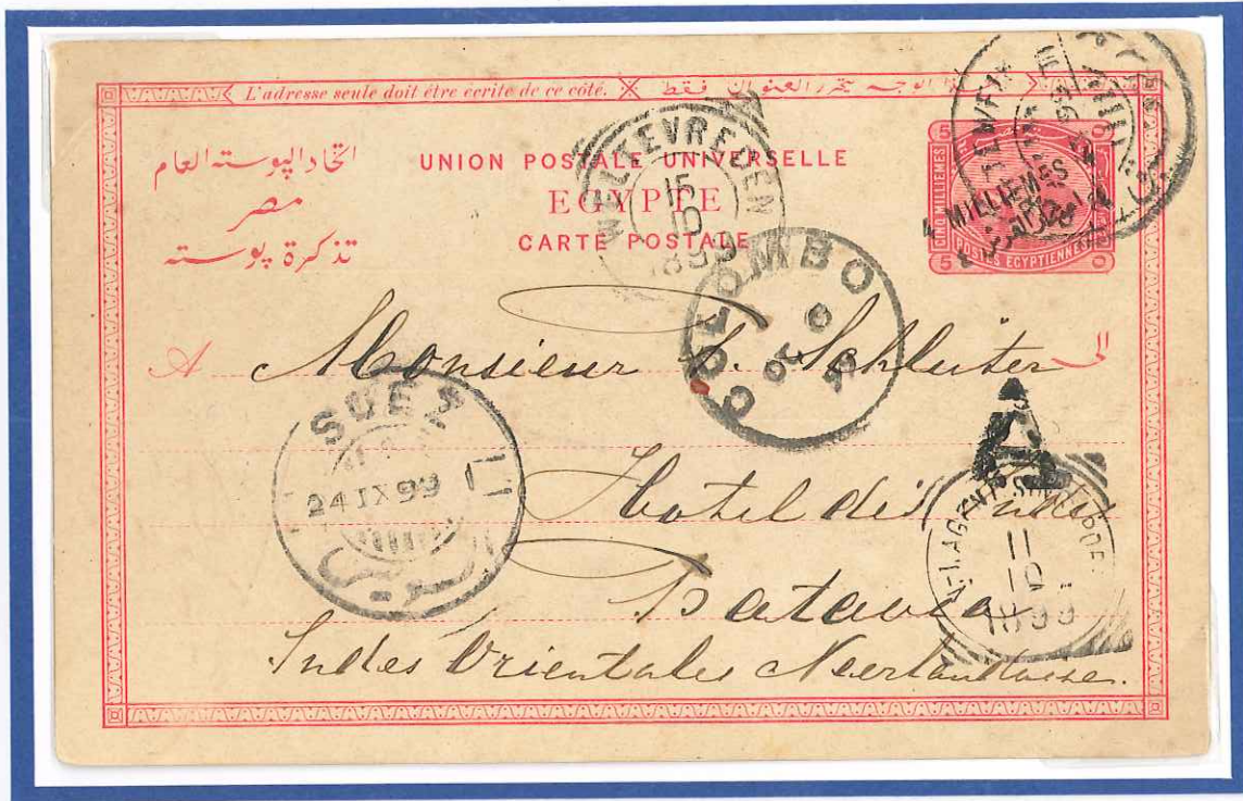
23-9-1899 Stationery postcard sent from PORT TEWFIQ to BATAVIA. Showing "SUEZ COLOMBO N.1 / AGENT SINGAPORE" with WELTEVREDEN transits one dated 15-10-1899. Transit time 23 days. Paid 4 Mills/ postcard. , covering the postal rate of destination.