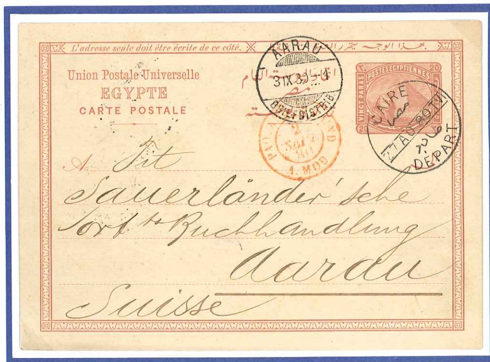
27 AUG 1880 Statinary postcard sent from CAIRO arriva AARAU on 31 AUG 1880 and arrival MARSEILLE on 2-10 , with "PAQ . AN.V. / BRIND. A MOD." in red c.d.s dated 2 AUG Transit time 5 days.

Paid 20 Paras. , covering the postal rate of destination.