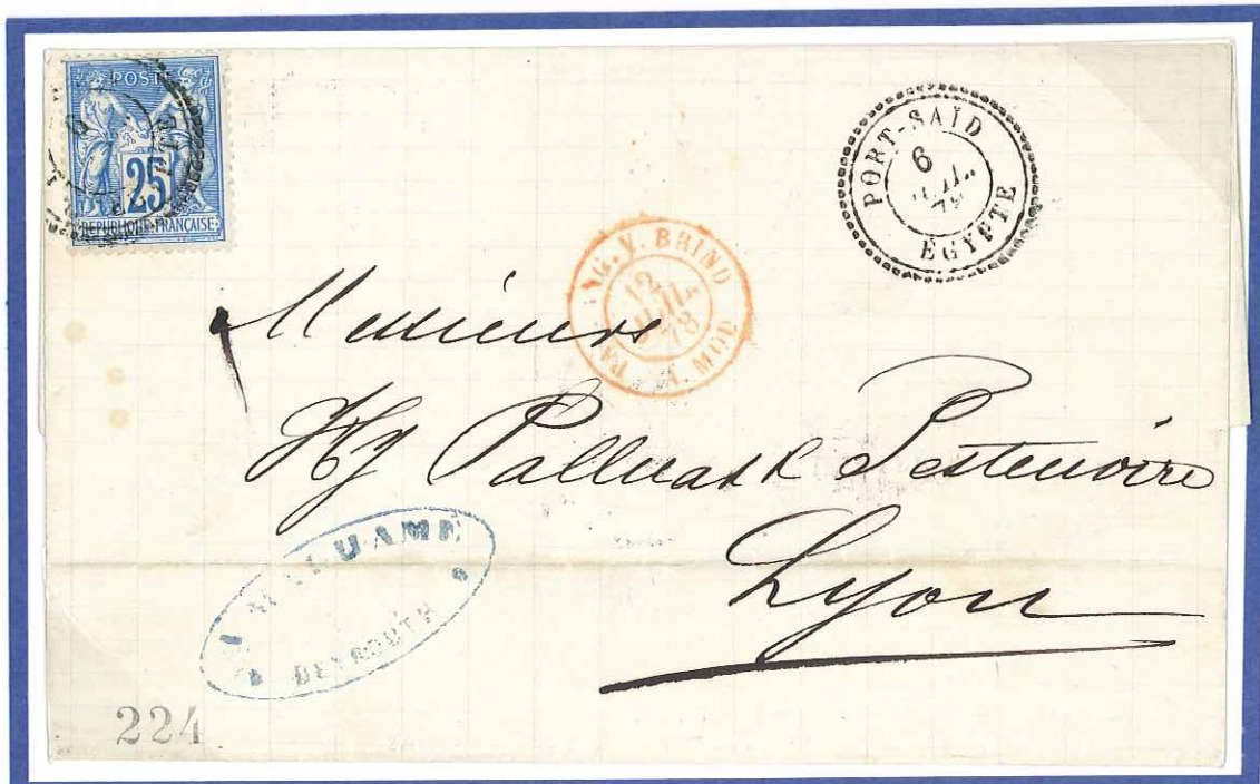
6JUL 1878 Entire sent from PORT SAID arrival LYON on 12JUL1878, and leave ALESANDRIA on 7-7 ,with " PAQ . AN.V. / BRIND. A MOD." in red c.d.s dated 12 JUL 78 . Transit time 9 days. Paid 25C. / 15 gr. , covering the postal rate of destination.