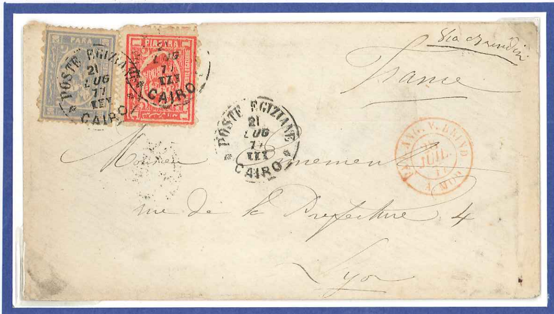
21 JUL 1877 Entire sent from CAIRO arriva LYON on 29 JUL 1877 and arrival MARSEILLE on 28 -7, with " PAQ . AN.V. / BRIND. A MOD." in red c.d.s dated 28 JUL 77 .With m/s "via brindisi" Transit time 23 days. Paid 1 P+ 20 Paras./ 10gr. , covering the postal rate of destination.