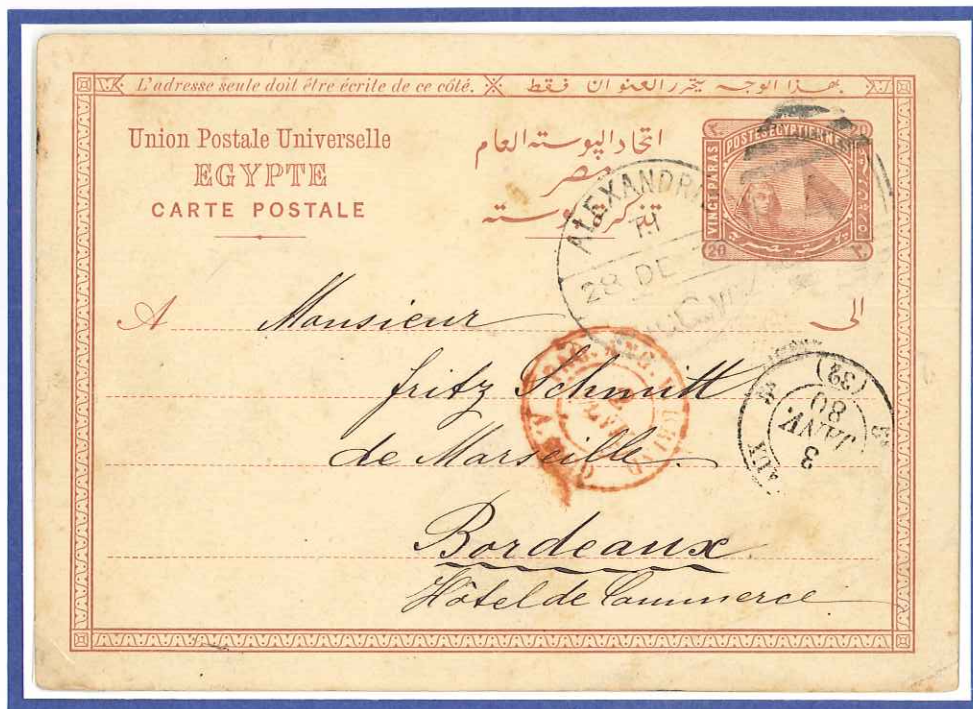
28 DE 1879 Statinary postcard sent from ALESANDRIA arriva BORDEAUX on 3 JAN 1880 and arrival MARSEILLE on 2-1, with "PAQ . AN.V. / BRIND. A MOD." in red c.d.s dated 2-1 Transit time 7 days.

Paid 20 Paras. , covering the postal rate of destination.