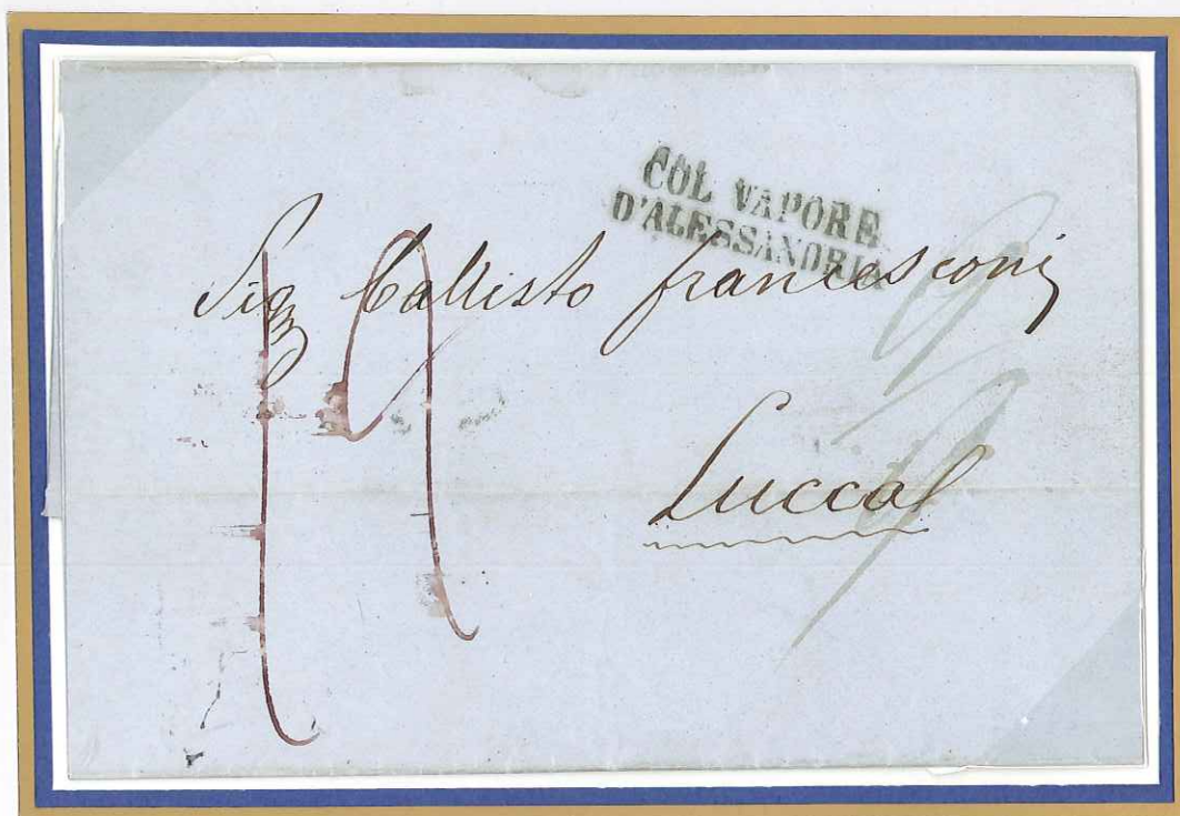
12 MAR 1858 Stampless folded entire letter sent from ALEXANDRIA to LUCCA (ITALY) on 25/3/1858 bearing hand stamp "COL VAPORE / D'ALESSANDRIA" in two line in green, via TRIEST c.d.s. dated 19/3/1858. Transit time 7 days. Paid 12 s./15gr., covering the postal rate of the destination.