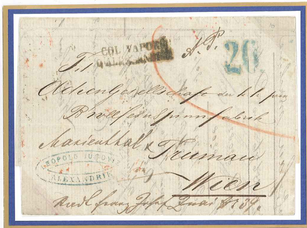
4 APR 1867 Stampless folded entire letter sent from ALEXANDRIA to WIEN on 9 APR 1867 bearing hand stamp "COL VAPORE / D'ALEXANDRIA" in two line in black, via TRIEST c.d.s. dated 9/4/1867. Transit time 6 days. Paid 20 s./15gr., covering the postal rate of the destination.