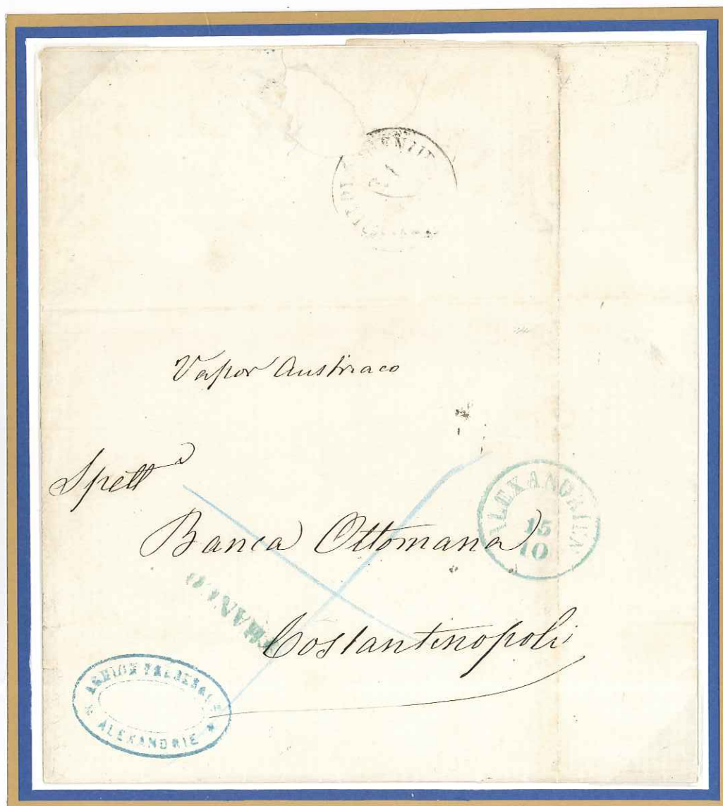
15 OC 1861 Stampless folded entire letter sent from AUSTRIAN post office in ALEXANDRIA to CONSTANTINOPLI on 31/10/1861 bearing hand stamp "LLOYD AGANZIE COS" on reverse And m/s "VAPOR AUSTRIACO", and hand stamp "FRANCO" in blue. Transit time 7 days. Paid 10 S./15gr., covering the postal rate of the destination.