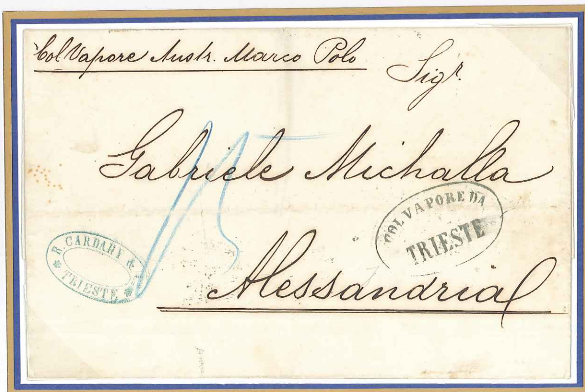
1 NO 1863 Stampless folded entire letter sent from TRIEST to AUSTRIAN post office in ALEXANDRIA c.d.s. dated 10/11/1863. Bearing hand stamp "COL VAPORE DA / TRIESTE" in green in oval and m/s "COL VAPORE MARCO POLO" in green in oval. Transit time 10 days. Paid 15 Soldi./15gr., covering the postal rate of the destination.