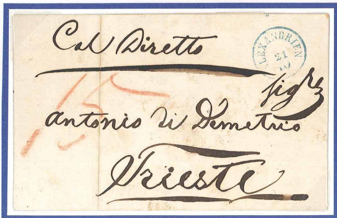
21 OC 1859 Stampless folded entire letter sent from AUSTRIAN post office in ALEXANDRIA c.d.s. dated 21/10 to TRIEST on 27/10, bearing m/s "COL DIRETTO". Transit time 7 days. Paid 15 Soldi./15gr., covering the postal rate of the destination.