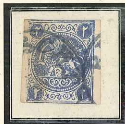
Type A – RESCHT Blue Postmark