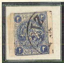
Type A – TABRIZ On Piece