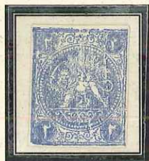
Type A Light Blue