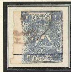
Type C Unidentified line across the stamp Postally used with RESCHT postmark