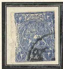
Type D Double perforations on left side Postally used with ZENDJAN postmark