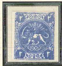
Type D Blue