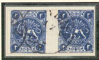
Types A-D from setting CBAD TABRIZ 17/8 postmarks