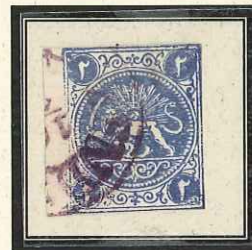
Type D – ZENDJAN Magenta Postmark