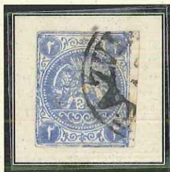
Type A - KAZVIN