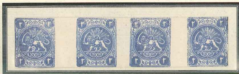
Complete sheet, setting ABCD