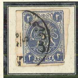
Type C – KAZVIN 28/5 On Piece