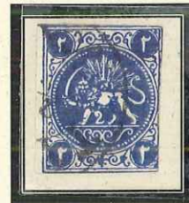
Type D Deep Blue