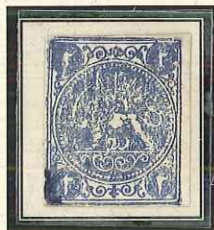
Type B Gray Blue