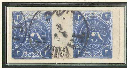
Type A-B from setting ABCD TABRIZ 17/8 postmarks