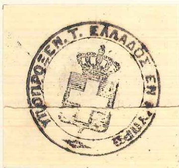
Stamp of the Consulate at back.

Halit Bey's dates of service in Cyprus are not recorded.