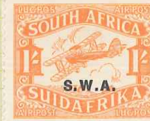
Type 10 late print SG 71b