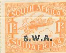
Overprint Type 11 SWA Large