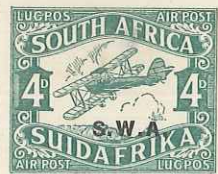
Type 10 late print SG 70b