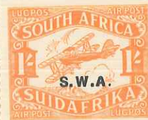
First printing SG 71