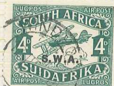
SG 70 First print