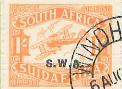
SG 71 First print