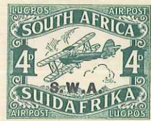
First printing SG 70