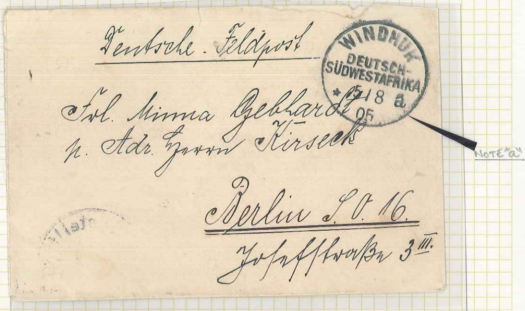
Herero Campaign Fieldpost cover from Windhoek to Berlin August 5 th 1905 (Cancelled with No. 4 with index "a" Page 168 Putzel - very rare)

Between 1883 and 1885 the governments of Great Britain, Germany, and Cape Colony disputed possession of the hinterland which was finally annexed by Germany with the exception of Walvis Bay Settlement.