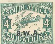
Overprinted Type 11 SWA Large