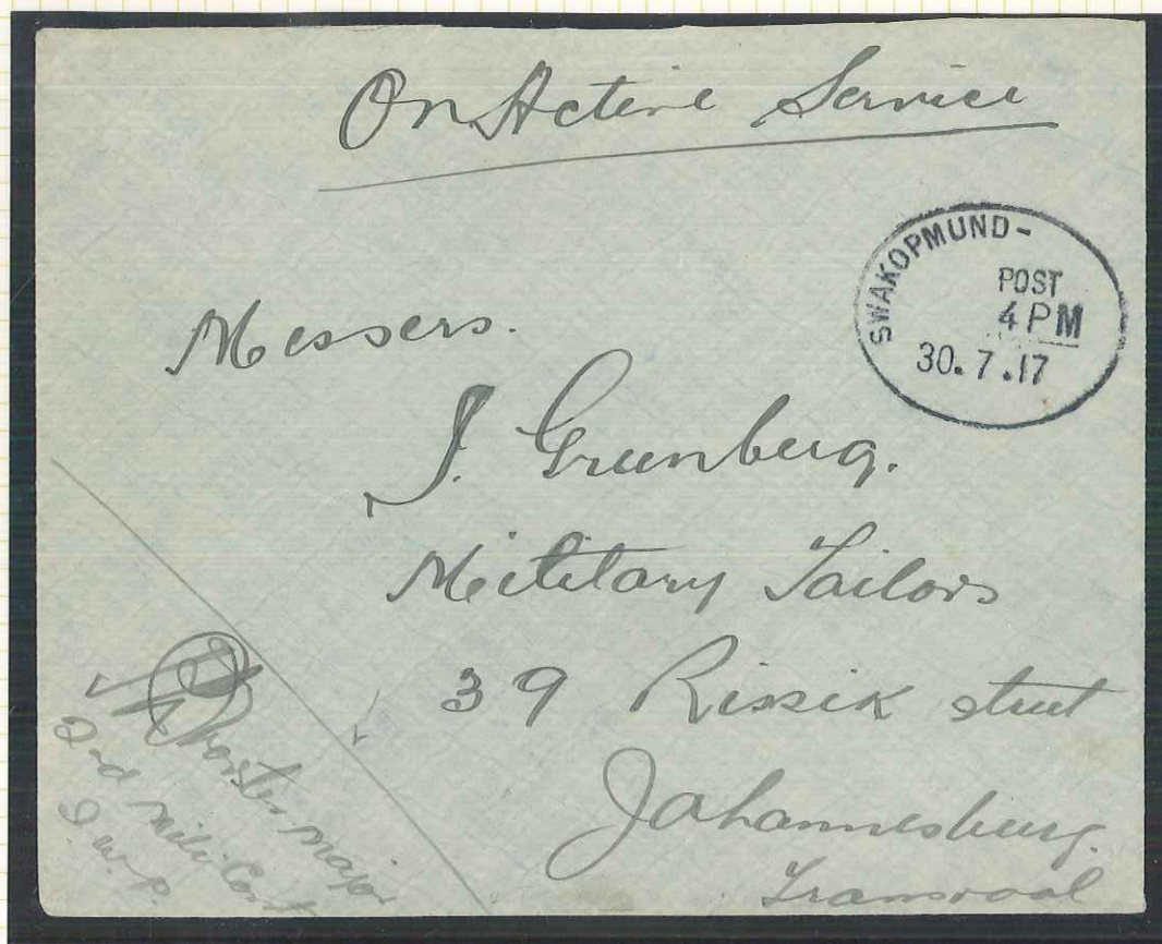
1917 (17 Jul) stampless soldier's letter to military tailors in Johannesburg, endorsed "On Active Service" at top and countersigned in lower left corner, cancelled by fine "SWAKOPMUND" oval ds (Putzel No. 6) adapted from the German Swakopmund-Windhoek train cancellation with "Windhoek" excised. Very fine.